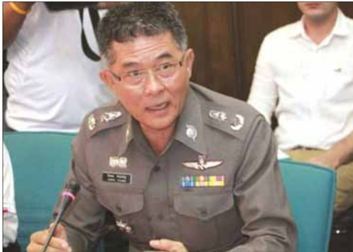
Gen Teeraphol ordered the transfer of three top-ranking officials from Phuket City Police to Phuket Provincial Police.

that the reasons behind the transfer and investigation were the officials' alleged inability to monitor gambling or illegal activities in their area of control, ignoring and neglecting gambling activities, and getting involved in a gambling network.