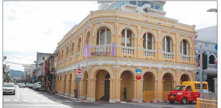
Peranakannitat Museum in Phuket Town.

PHUKET City Municipality officials have confirmed that the Peranakannitat Museum launched earlier this month will be ready and open to the public within a month's time.