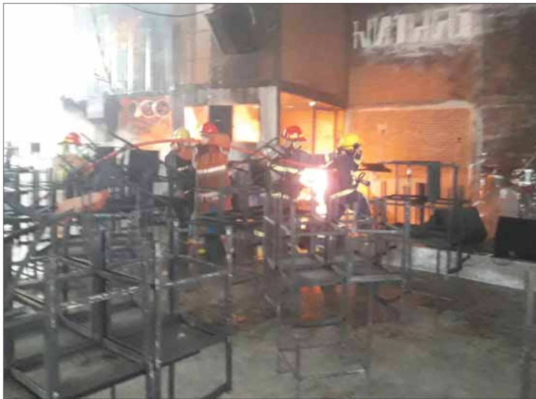
Two fires broke out in Phuket on May 28 and 29, both of which are believed to have occurred due to short circuits. The total damage from the two incidents is estimated at 400,000 baht. The first fire started at 'Mahanakorn', a popular local bar in Phuket Town, at midnight, while the second one occurred at a house in Soi Sapham in Koh Kaew. Nobody was injured in either incident.

Authority (PEA) on May 25 to discuss possible solutions to the messy overhead cables in Patong. After receiving a horde of complaints about the unsightly cables on Sawatdirak Road, PEA officials insisted, as is standard, that electricity cables are not to blame.