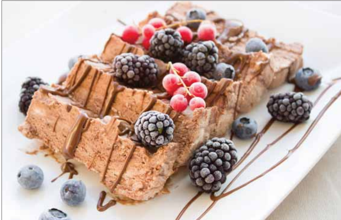
There are many known benefits of raw 100 per cent natural cacao.

Highly processed foods with high fructose corn syrup (such as soft drinks and most candies) and hydrogenated fats like deep fried foods, offer no nutrition and can actually steal key nutrients from your body to