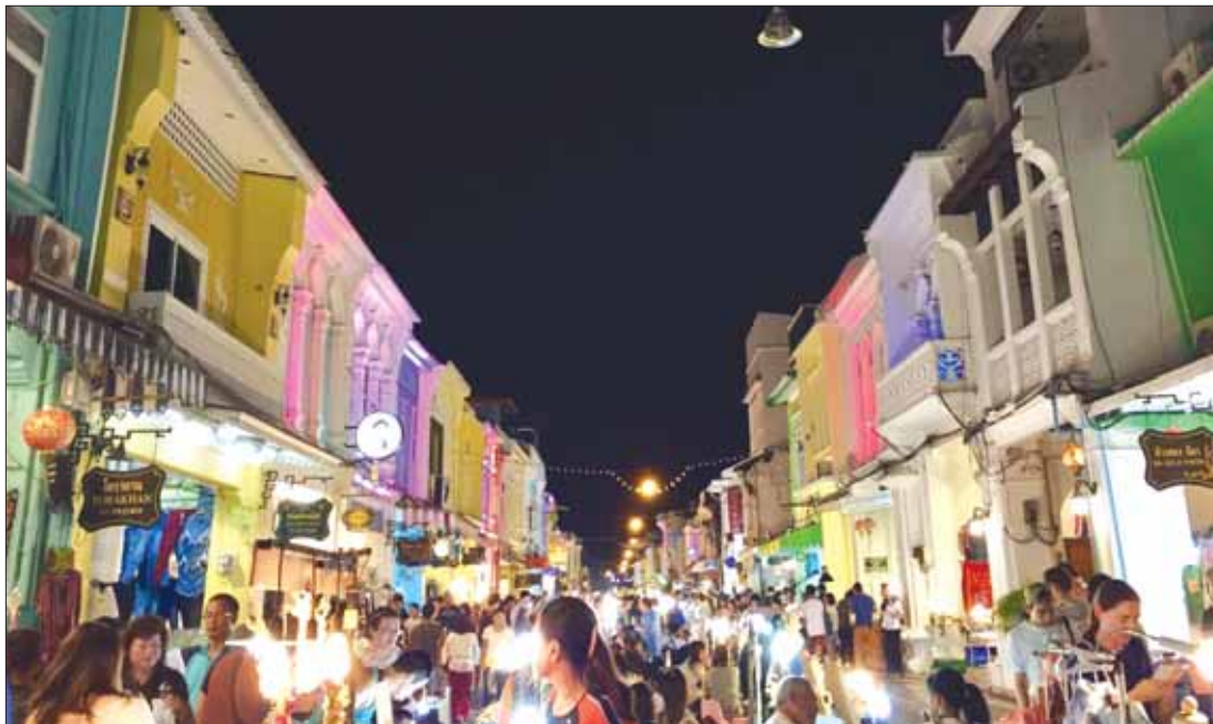
Phuket real estate agents have helped developed the ‘East Coast’ which used to be considered ‘undevelopable’ – the weekly night market in Phuket Town is just one example.

Property agents face a market where their role is made ultra difficult due to the flooding of the sector with unprofessional ‘wannabe’ agents who, using a website, mobile phone and car, guess their way around the island. They talk about ‘new upcoming areas’ and pray that their unknowing customers won’t notice the neighboring bare adjacent land where the latest karaoke bar and labor camp are just about to be erected a stone’s throw away from their dream home.