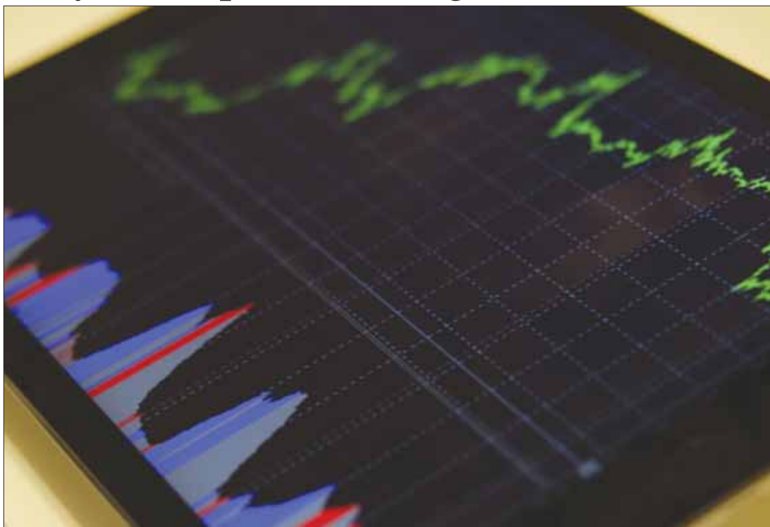
Charts provide signals for stock selection by showing bigger time frames and trends.

als manufacturer Builders First Source (NASDAQ: BLDR) got clobbered in the wake of the financial crisis and is still not back up to pre-crisis highs. However, BLDR's monthly chart is finally starting to show and break out from a strong cup and handle base. This should also be considered a bullish sign for other housing related and building material stocks.