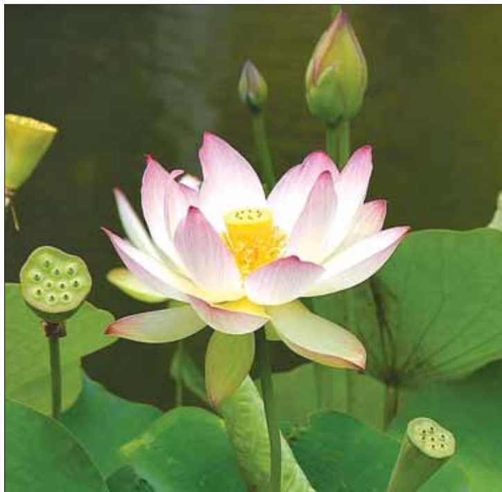
The lotus is one of the eight auspicious signs of Buddha – a symbol of cosmic harmony or spiritual illumination.

In Phuket, I have never relegated this marvel to the kitchen garden, though everything is edible – flowers, seeds, leaves, even the rhizomes. Instead, I planted a couple, Thai style, in waterproof earthenware pots, half filled with the rich, glutinous mud sold at nurseries – and