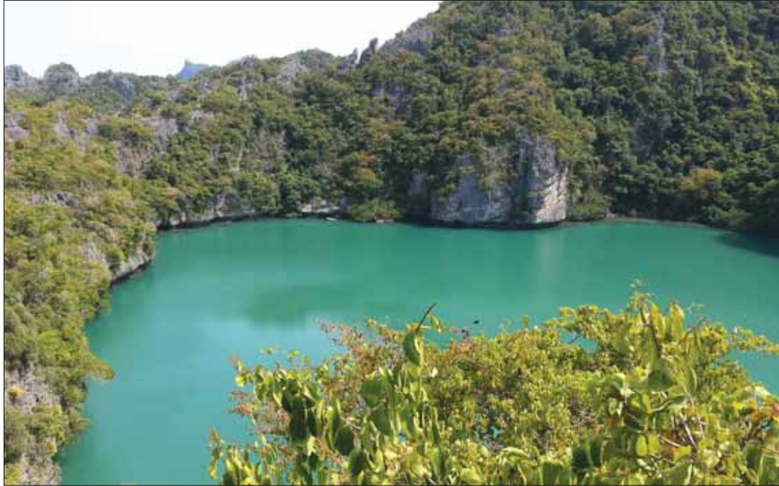
A stunning view of the Ang Thong Marine National Park located just off Samui.

While the number of visiting yachts to the island is relatively small, Samui is not unknown to the sailing community in Asia. The Samui Regatta, which has just concluded at Centara Grand Beach Resort Samui, has long been