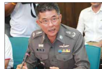
Gen Teerapol.

“I have already checked and can confirm that this is merely a rumor. I want the media to help us urge the public to be careful of spreading such messages. They can create mass panic, so please think twice before believing or sharing