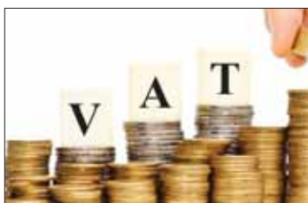
NLA wants to increase VAT from 7 to 8 per cent.

He said the Finance Ministry is upgrading tax collection under the national e-payment project. This could help tax officials collect an additional 100 billion baht annually, he said.