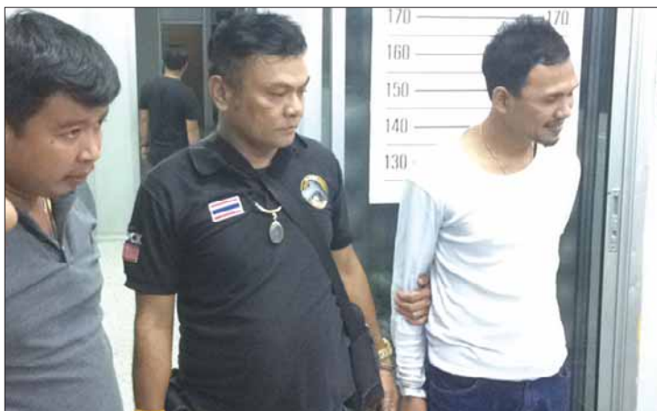
The suspects posed as Region 8 police officers.

They then called their relatives and friends, asking for 30,000 baht each in exchange