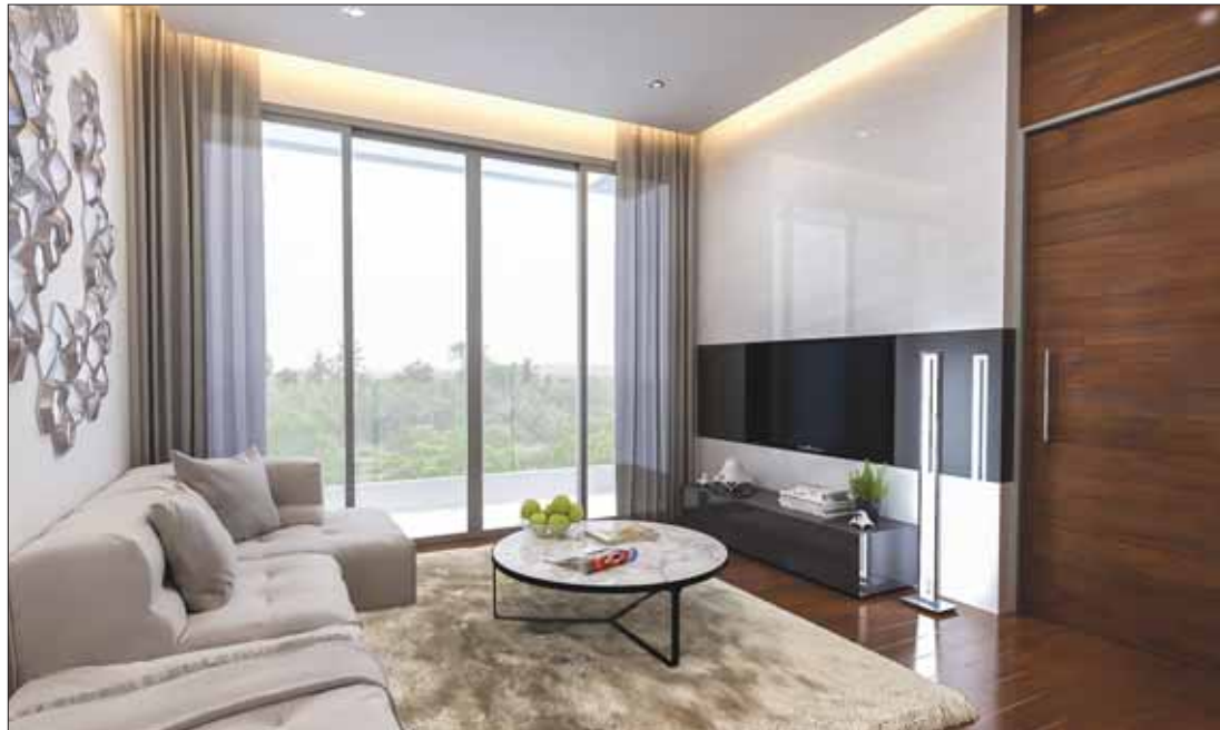
The condos are targeted at high-end customers who demand comfort .

“Bang Tao is centrally located and has access to many