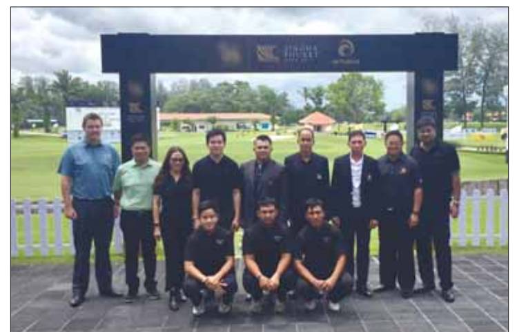
Key panelists, VIP guests and Laguna Golf Phuket's homegrown young golfers strike a pose.

"With a world-class golf course and facilities, excellent