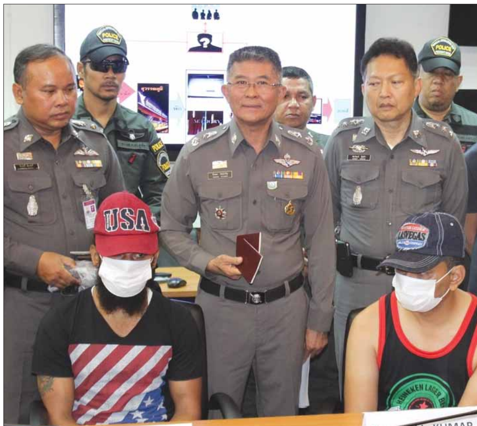
The men confessed that they were Indian by birth and wished to work in Canada, so they paid an agent in Thailand more than two million baht for fake passports.

On May 19, they boarded a flight to Canada at Phuket International Airport