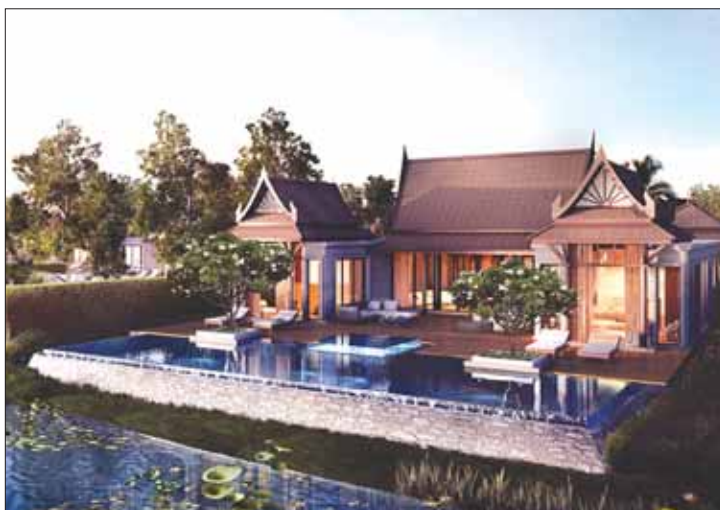
The Grand Residences include a selection of Thai inspired 5-bedroom villas in a gated estate near Bang Tao Beach.

Banyan Tree's global property portfolio, the Grand Residences include a selection of