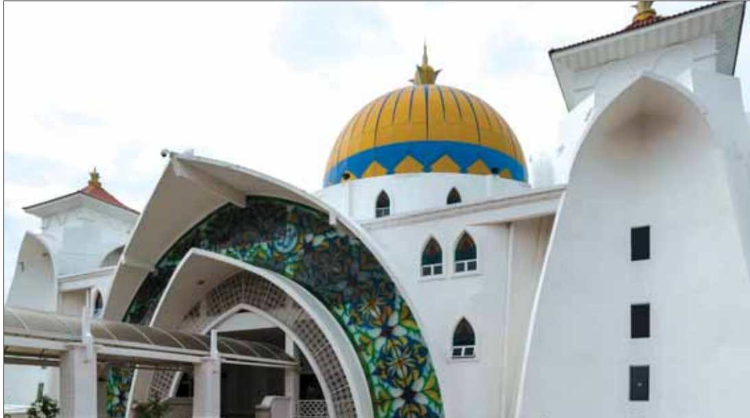
Predominantly Muslim Malacca embraced Islam during the 15th century.

In Patani, Muslim influence arrived when Muslim refugees from Pasai, fleeing religious persecution in Sumatra, settled in Patani. They began preaching Islam to the locals and later