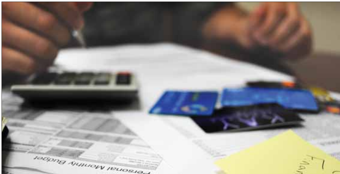
When collecting debt, it is important to ensure that it is enforceable.

The Thai Civil and Commercial Code covers multiple types of relationships. It is important to review the type