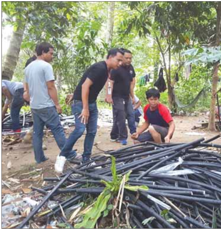
The suspects admitted to stealing wires and burning the sheaths to extract the copper inside.