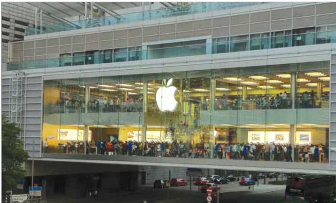
Looking at technical charts of leadership stocks such as Apple shows no evidence that the so-called 'smart money' investors are selling shares or taking profits off the table.

Track the iShares North American Tech-Software ETF (NYSEARCA: IGV) performance. This particular ETF focuses on a high growth sector and its performance gives us a better indicator about stocks