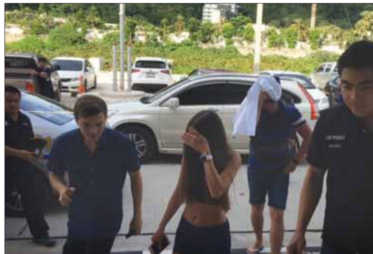
The couple involved in the tuk-tuk episode in Karon arrive at the police station with their interpreter (left).

DURING the course of last week, two separate foreign couples were caught on camera having sex in public. A Russian couple was engaged in sexual misdemeanor in the back of a tuk-tuk in Karon on May 5, while a Spanish man was video taped having sex with a Russian woman by the beachside in Koh Samui on May 8.