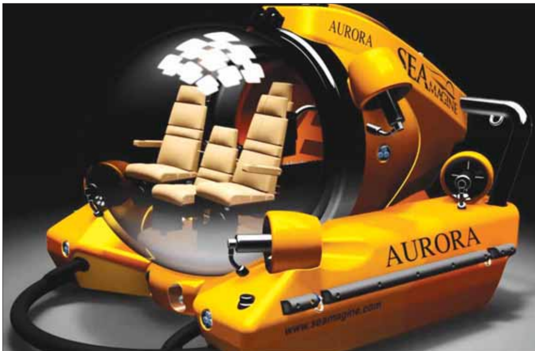
The AURORA-4 is a private submarine which allows a group of friends to extensively explore the underwater world at the depth of 330 meters.

need for a submarine is rather subjective. Reasons ranging from ‘defence’, ‘security’ as well as the fact that Malaysia, Singapore, Vietnam and Indonesia all have submarines and therefore Thailand also should obtain them. Those in opposition of acquiring the submarines claim that the Gulf of Thailand isn’t deep enough and the country has no regional enemies nor is it likely to have any.