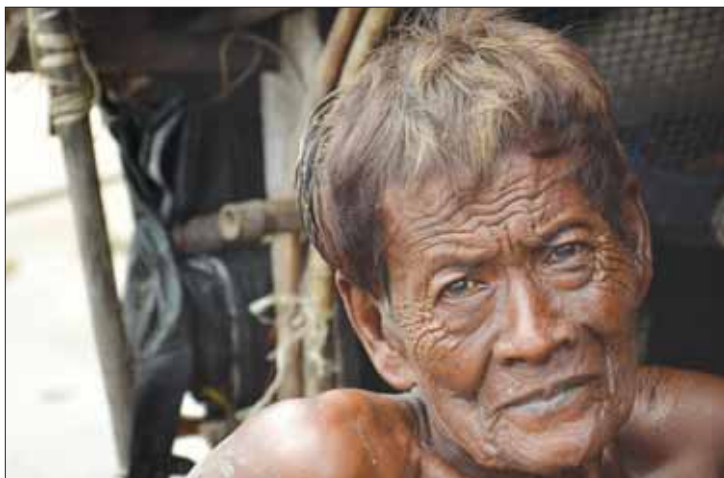
Sea gypsies' skin is lined from exposure to nature.

THE sea gypsies (also known as Moken or Chao Le ) are the oldest inhabitants of Phuket – they have probably been living around these shores for 2,000 years. In common with nomadic seafaring groups the world over, they settled in one area and only moved on when the natural resources were depleted.