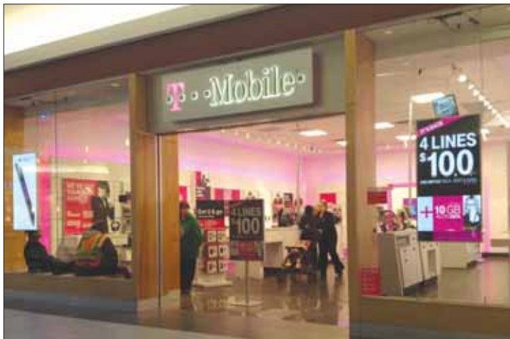
T-Mobile is holding up well throughout the pullback.

Despite the increasingly scary news (such as North Koreans with nukes), we are still seeing individual leadership stocks stay-