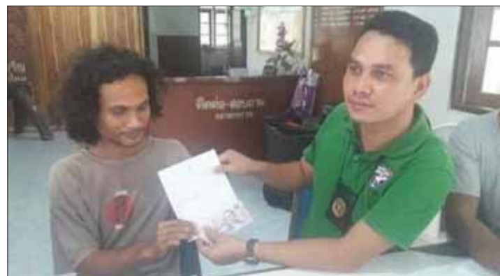
The tour guide (left) was fined 500 baht, while the tourist merely posted an apology on social media.