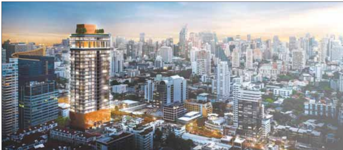
Phuket-based realtor Siam Real Estate is now representing several large projects in Bangkok. Seen above is the Philippe Starck designed KHUN by Yoo.

This innovative approach to real estate PR is sure to attract interest from FMD's core live audience of high-earning locals and expats in the Thai capital,