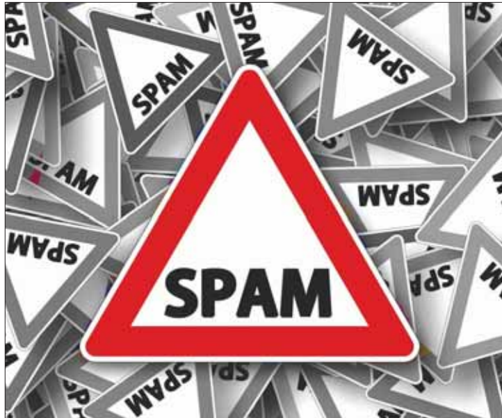
People send out emails in order to target potential customers, but they all mostly end up in spam folders.

what could possibly go wrong? Quite a lot it seems.