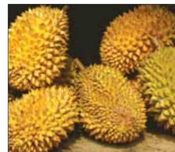
A GI label will enhance the fruit's value.

They also intend to classify Phuket durian as a Geographical Indication (GI) product – items that have a specific geographical origin and possess qualities or a reputation that are