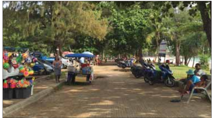
A weekly walking street is planned at Surin.