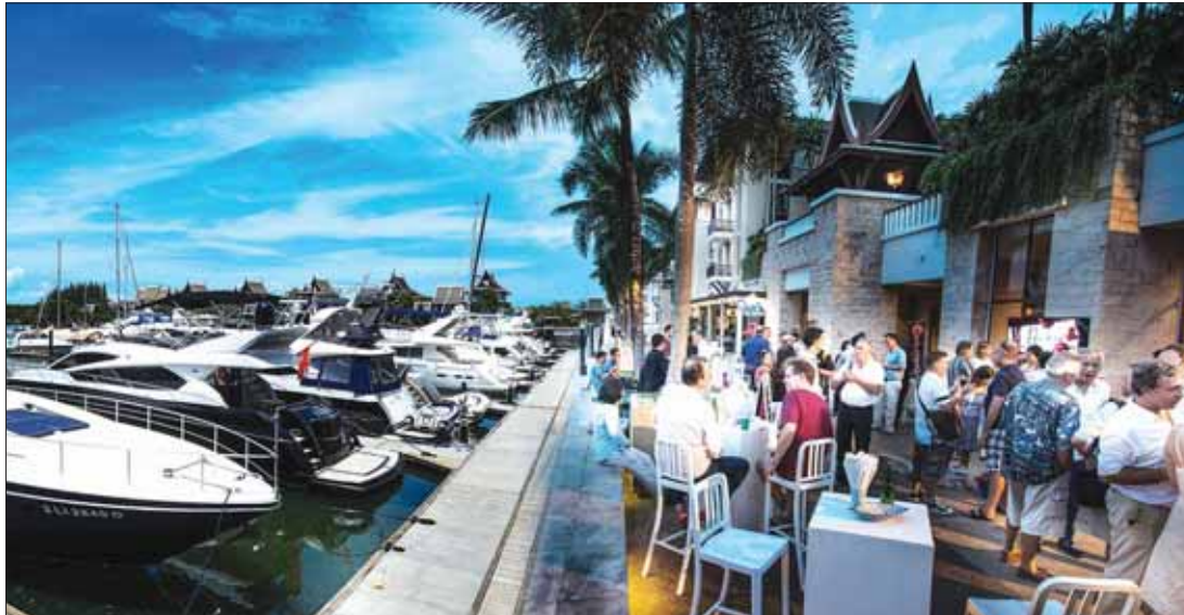
Phuket's marinas are now drawing crowds with a flurry of monthly events.

A little further south are the centrally located Phuket Boat Lagoon and Royal Phuket Marina. These neighbors are reshaping the surrounding area of Koh Kaew and are development clusters and market generators in their own right. The Villa Market at Phuket Boat Lagoon draws people to