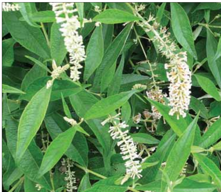
The buddleia paniculata is one of the specimens of white flowering shrubs found in many Phuket gardens.

The dwarf tabernaemontana has smaller flowers that remind me of propellers and look as though they should be revolving in the breeze. An evergreen shrub with a compact habit, it