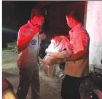
The pair were found hanging in Nai Thon.