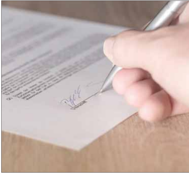
Current law allows foreigners to 'renew' 30-year leases.

land being owned directly by foreigners, you are better off if you forget about it. The idea of that is mostly offensive to many Thais; in fact, in many countries, ownership is restricted to the entire population to leasehold only. Take Hong Kong SAR for example, where only St John's Cathedral is freehold.