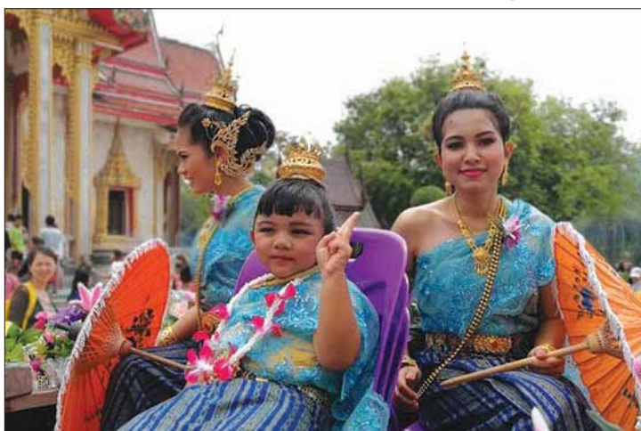
Traditional Songkran festivities were held in Chalong and Phuket Old Town.

"Following strict instructions of the government to control drugs and alcohol during the festival, it will be good to have