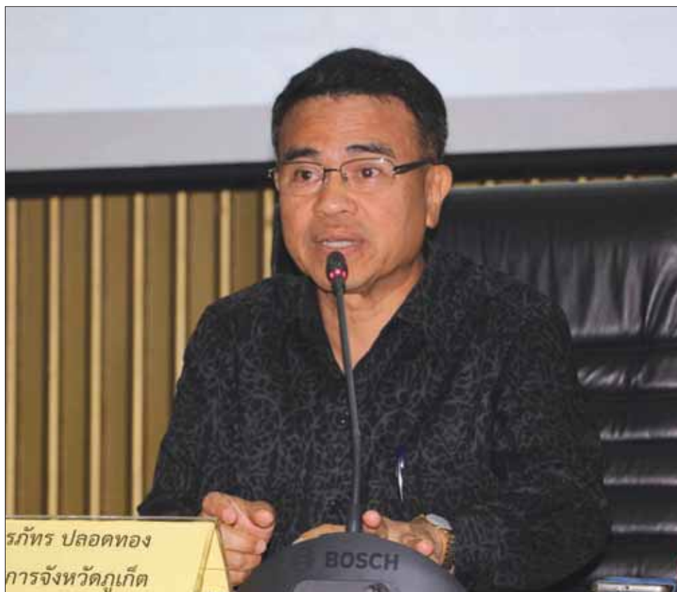
New Phuket Governor Norraphat Plodthong told the press that wants cleanliness to be a continuous battle and not just a one-day event.

The governor acknowledged that Phuket has many other problems waiting to be solved, but that cleanliness was the easiest one to start with. The project is ex-