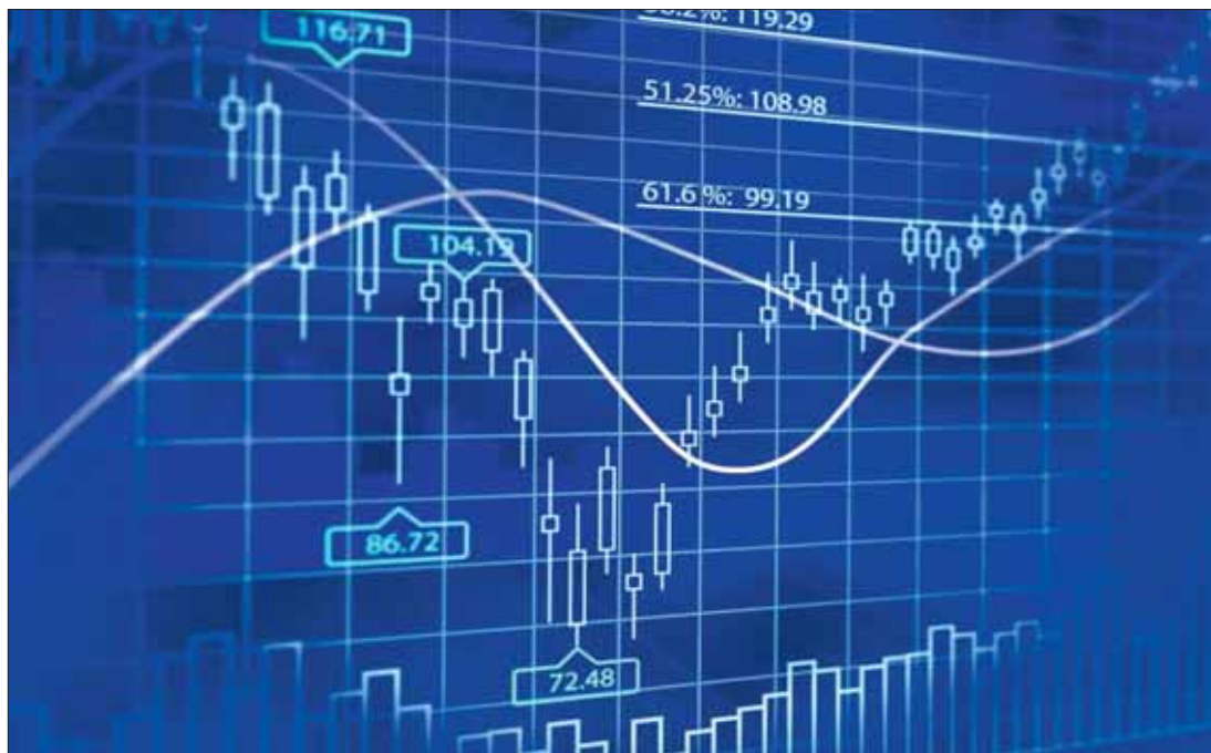
Detailed charts have day to day noise, but they can be useful for spotting resistance levels.

and shares outstanding will tell you how big and well traded a stock is. LGIH has a market capitalization of about US$672 million making it a small cap. A few hundred thousand shares are traded per day, meaning that its reasonably well traded for a company of its size. A more lightly traded stock (under 50,000 shares a day, for instance) will be much more volatile.