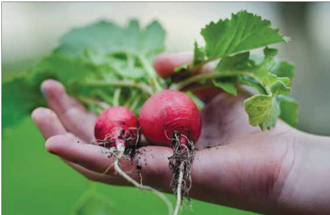
Having children grow vegetables is a good way to engage their interest in eating them.

2. Don't give up on certain vegetables. Taste buds change over time, so keep putting vegetables in front of your kids in different ways.