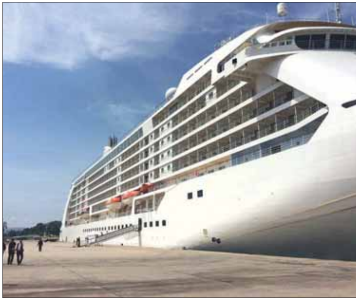
The expansion is expected to take 13 months to complete, but no starting date has been announced yet.

He also added that the Treasury Department has chosen Phuket Deep Sea Port Co Ltd to build the expansion zone, including a new one-story building reflecting the culture