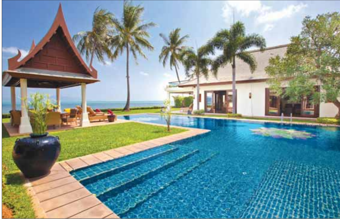
Luxury villa rentals are picking up in Phuket after two sluggish holiday seasons.

Nearly all of the early inquiries are from the Russian market and with the strengthening of the Russian ruble and US dollar, it looks like the more popular villas could be snapped