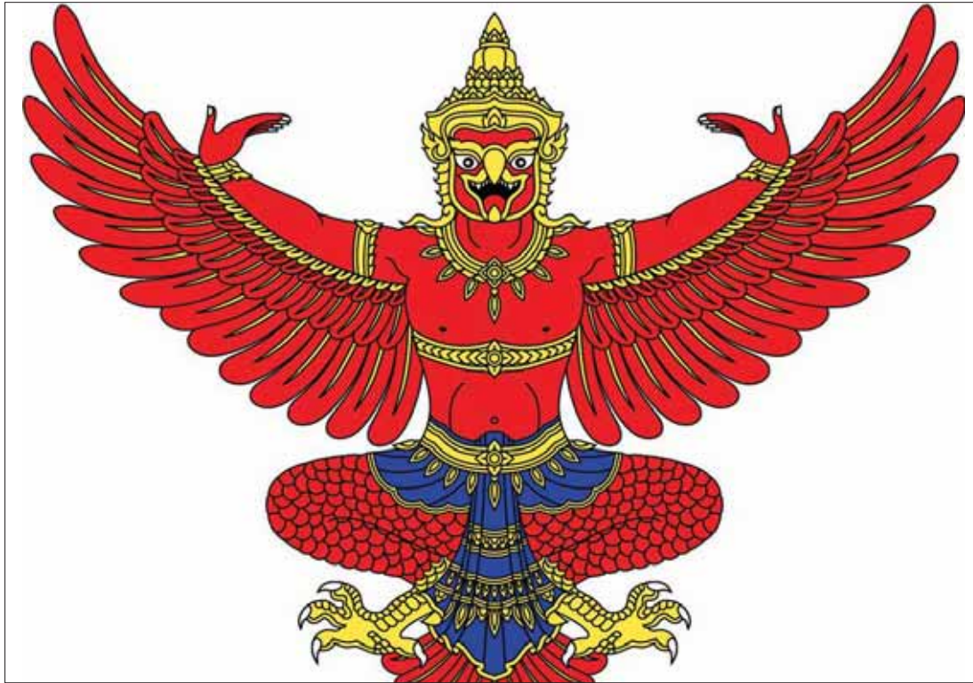
The Garuda is the Royal standard of the Thai government as well as the symbol of the King.

with Narayana, who, in Hindu scriptures, is one of the most important of all the Brahman gods. According to legend, Narayana made a bargain with the Garuda. In return for the gift of immortality, the Garuda promised to become Narayana's mode of transport. Narayana would ride on the Garuda's back as he flew across the heavens. In Hindu folklore, Narayana is often depicted riding on the Garuda's back.