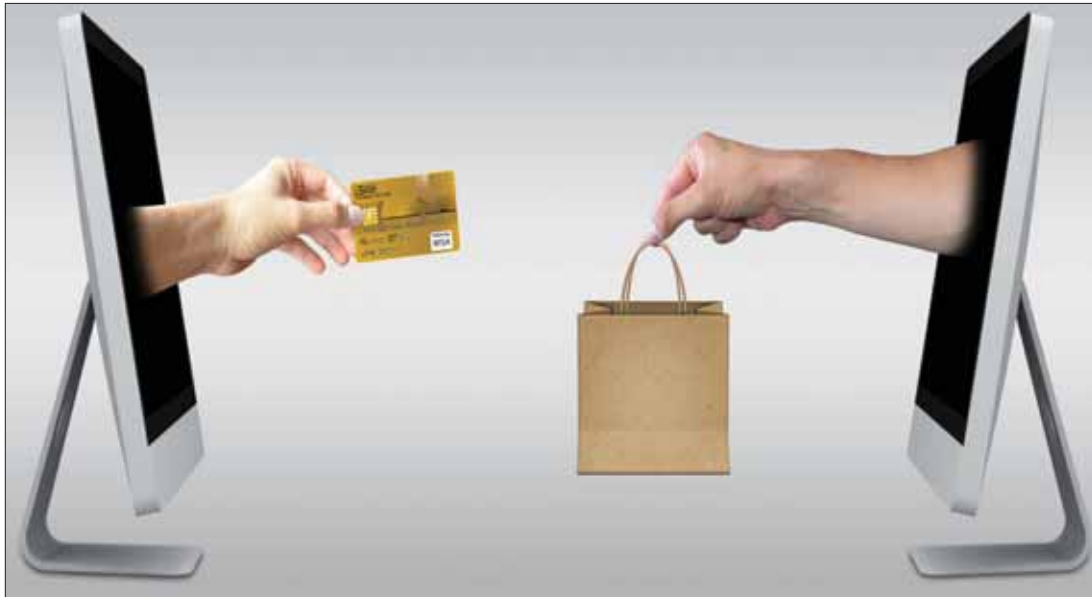
Online shopping has become more convenient and easily accessible over the years.

One of the reasons why people lean toward online shopping as compared to traditional retail shopping in malls is because of the heavy traffic one has to brave just to get to the mall. Most would opt to place orders in the comfort of