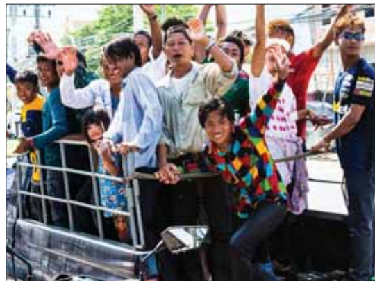
It is important to celebrate responsibly during Songkran.

5. Take care of yourself. Even though Songkran isn't the time to be dolled up, you should still apply sunscreen to avoid nasty burns and keep yourself hydrated as it is the hottest time of the year.