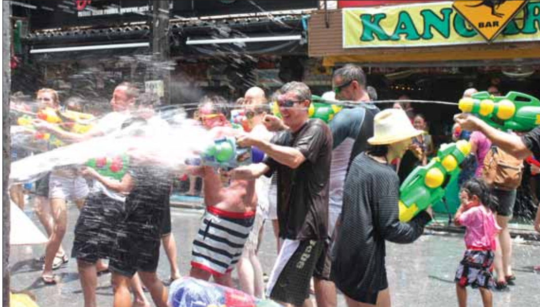
Large numbers of tourists come to Thailand to join in the festivities.

Some examples of unacceptable behavior are defacing private and public property; urinating, defecating or vomiting on other people's property; fighting; or joining in a public brawl. These individuals can also face imprisonment and a fine.