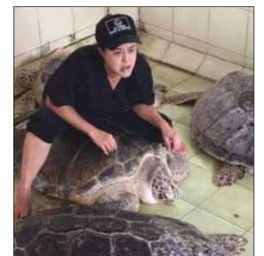
VMARC vets performed health check-ups.

Ormsin became famous after surgery was performed on the animal to extract 915 coins from its stomach. The turtle had swallowed the coins thrown into her pond by people who believed it would bring longevity and good luck. The turtle died soon after the procedure.