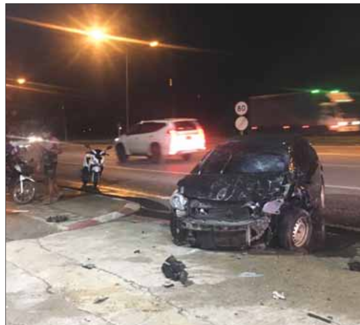
The accident occurred on Thepkrasattri road (southbound) near the Shell gas station in Thalang.

A 62-YEAR-old motorcyclist was killed in a collision with a car driven by a 31-year-old British woman in Thalang on March 31.