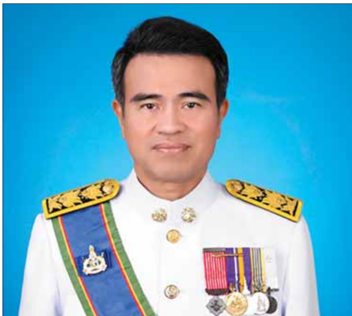
Norraphat Plodthong (above) has been named the new Governor.