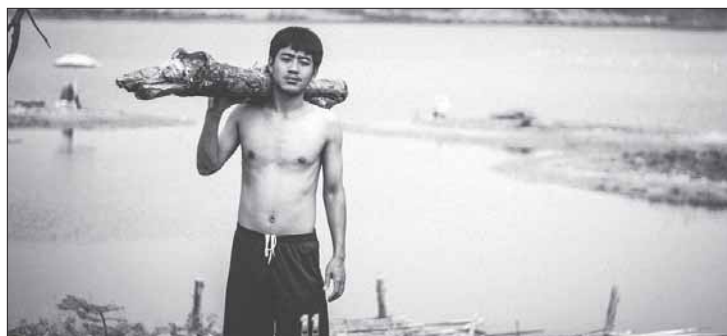
Officials expect at least 10 million people to register.

A LARGE number of low-income people queued up to apply for state welfare as the second round of registrations opened nationwide on April 3.