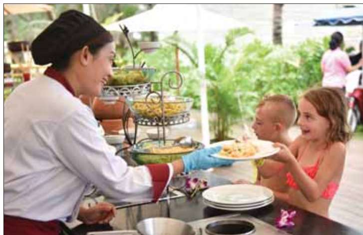
Xana is offering complimentary dining for kids under 6.

XANA beach Club is hosting a Sunday Easter Brunch on April 16, with a 50 per cent discount for children aged 6-12, and complimentary dining for all kids under 6.