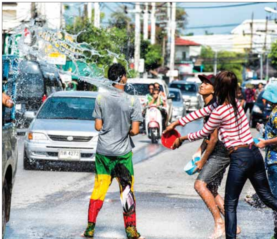
Partygoers celebrate on Phuket's notorious Bangla Road.

will also be held throughout Phuket for visitors to enjoy, including food and art festivals, games and parades.