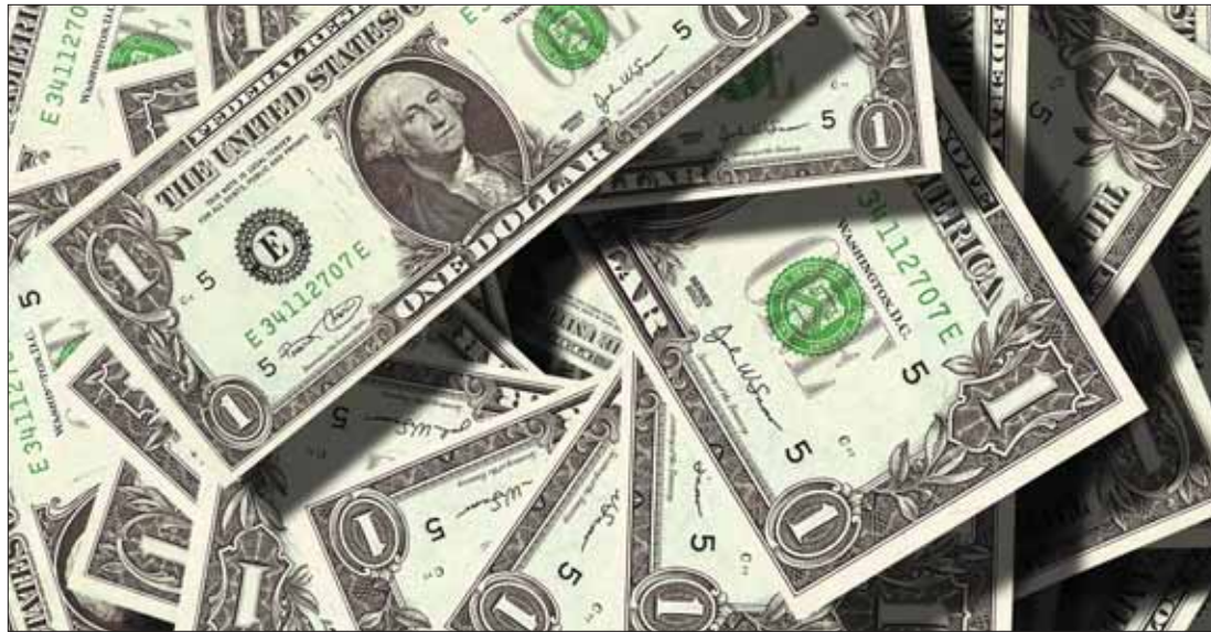
The Federal Reserve has raised interest rates, but the market has largely ignored the move.

I would expect the Fed to slowly want to raise interest rates back up to the 3 per cent