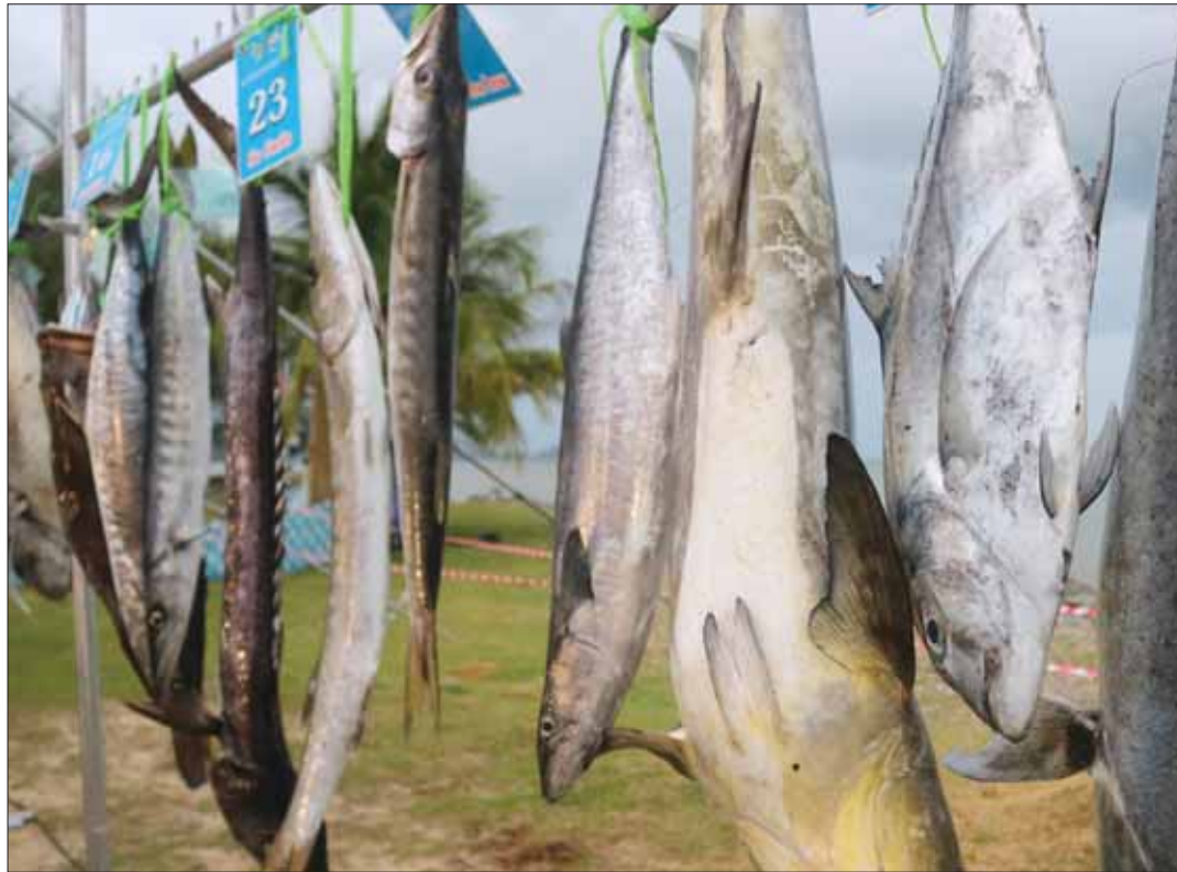
The Phuket Municipality Office hosted the 8th annual Fishing festival on April 2, raking in about 150,000 baht for shrine renovation and supporting education. Phuket City Mayor Somjai Suwansupana chaired the event, which took place at the Prince Chumphon Khet Udomsak Shrine in Saphan Hin. She also helped cook food to be distributed at the festival. She added that an event such as this supports government policy to preserve local fishing for the long run. About 100,000 baht is to be used to restore the shrine, while the other 50,000 will go to support education in Cherng Talay.

they purchased the animal from Tak Province.