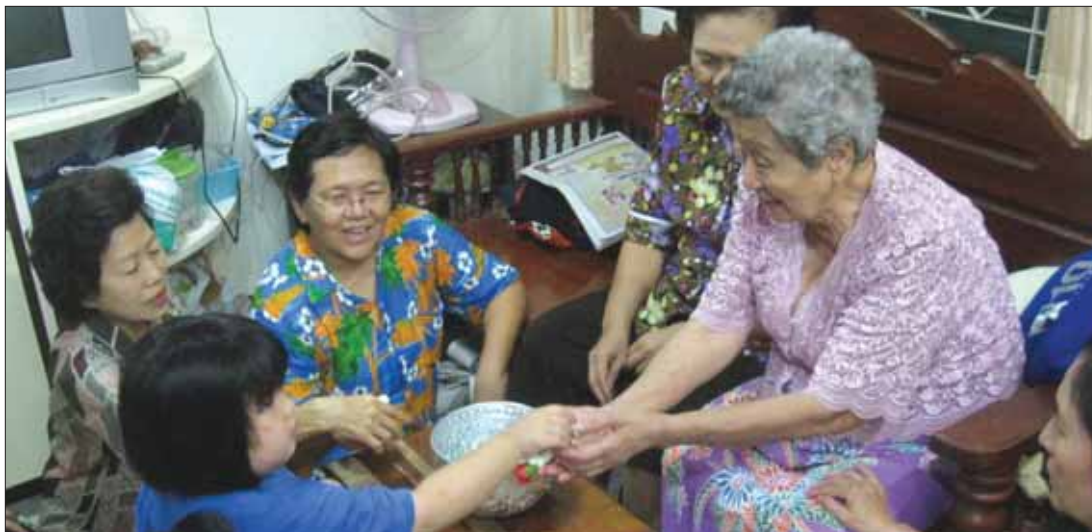
The young pour water over the palms of the elderly as a sign of reverence to ancestors .

If you are foolhardy enough to join the celebrations, you may also be covered in a mix of water and white talc or chalk, a tradition begun by monks as a way of marking blessings. This use of powder seems to come from the Indian festival of Holi , which, like the Christian Easter, is celebrated at the