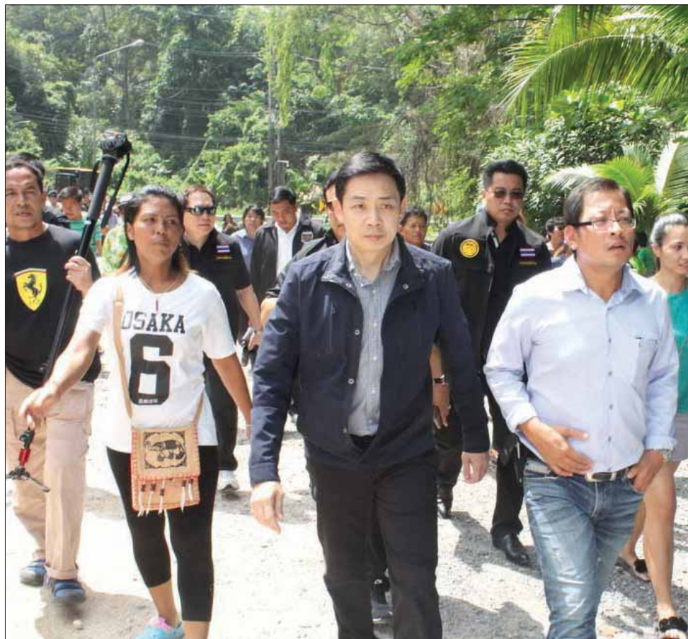
About 200 locals gathered at Laem Singh Beach on the morning of March 23, holding signs and messages of protest.

“The court has yet to conclude the case,