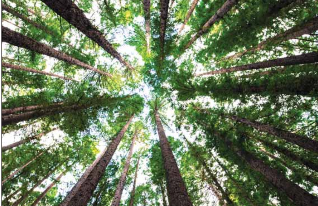
Trees prevent floods and landslides, and their foliage helps to stabilize weather conditions.

Having said that, there are some encouraging signs. The use of coal globally is in 'free fall', according to a new report by Greenpeace, down 62 per cent in India and China, the two biggest consumers. China, literally worried to death by atmospheric pollution, has shut down its last coal power station in Beijing, and halted work on a hundred new coal-fired projects. A record number of coal power stations have closed down in the US