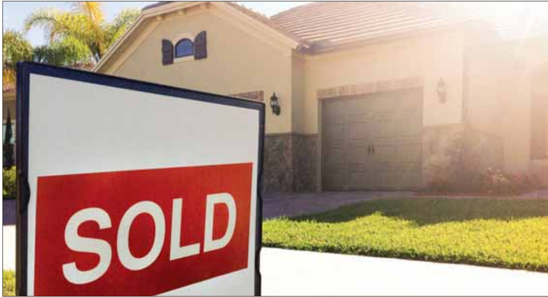
Issues occur when expectations are mismanaged or contrast with reality.

There are, as in all jurisdictions, good developers and bad.