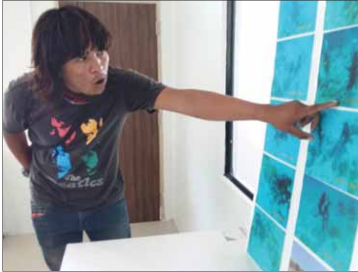
DMCR has filed complaints against both the diving instructor as well as the company's Korean manager.