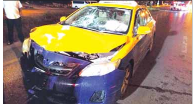
The taxi was considerably damaged on impact.

A TEEN motorcyclist was killed on March 25, this time in a bloody crash with an airport taxi at a U-turn on the Bypass Road.