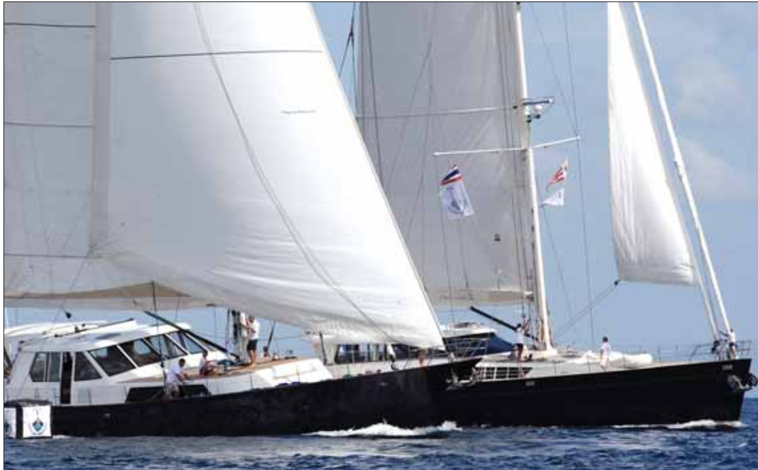
TMBA has an important role to play in the direction of Thailand's marine industry.

No matter what the topic or industry, governments around the world target big ticket items as a priority. The term 'grassroots' is often little more than a concept – heavily used in policy documents and speeches, it makes a great PR soundbite. However, govern-