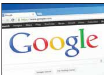
Google announced it would give firms more control.