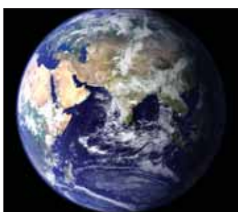
The documentary aired in Bangkok on March 30.

"This might be the first time it's being seen in Asia," says Thai PBS director-general