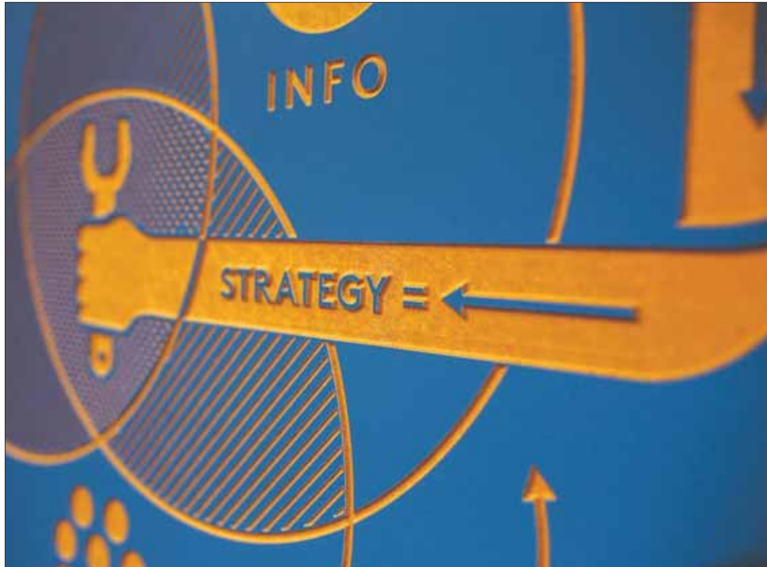
Over time, 96 per cent of mutual fund managers fail to beat the market.

Even more diabolical is what the big banks and asset management companies do, which is to start a hundred incubator funds over the course of a few