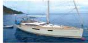
Jeanneau 57 (2010) 495,000 USD