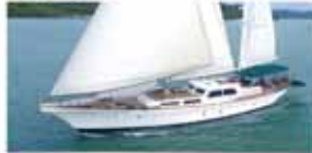
Don Brooke 80 Pilot House (1980 / 2016) - 375,000 USD