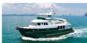
Northern Marine 64 LRC (2001) 1,300,000 USD