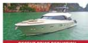
RECENT PRICE REDUCTION Monte Carlo Yachts 70 (2015) 2,600,000 EUR