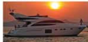
Princess 64 (2011) 1,380,000 USD