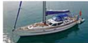
Oyster 53 (2002) 325,000 GBP