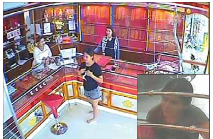
The suspect's face was captured by CCTV cameras at both the stores she stole from.

She then filed an official complaint and submitted the