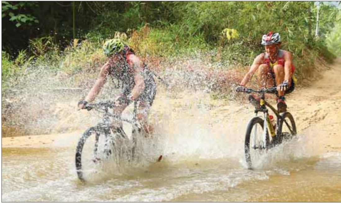
Xterra Samui, held in September 2016, drew a positive response from the athletic community.