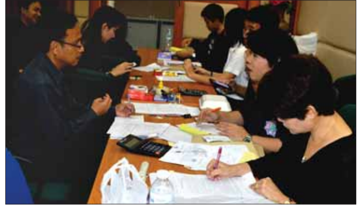
The auction was held at Phuket City Municipality.

THE Anti-Money Laundering Office (AMLO) has sold all of Tranlee Travel Co's assets, 151 items in all, after four auctions yielded total revenue of only 204 million baht (approx US$6 million).