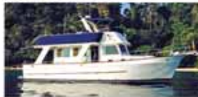
Clipper 40 Europa (2008) 269,000 USD