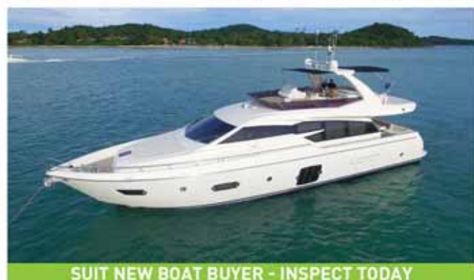
SUIT NEW BOAT BUYER - INSPECT TODAY

JIM POULSEN +66 81 891 3237 jim@leemarine.net