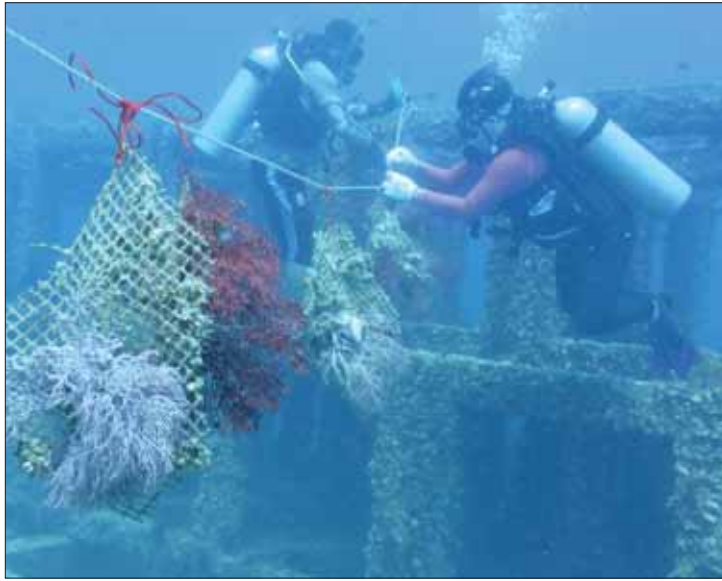
Over 250 pieces of coral were added to the artificial reef in Koh Mai Thon.

"The coral we used is about a year old. We took it from places where it grew naturally, mainly ports. For instance, this lot is mostly from Ao Po Grand Marina,"