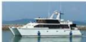
Alwoplast 63 Power Catamaran (2007) - 585,000 USD