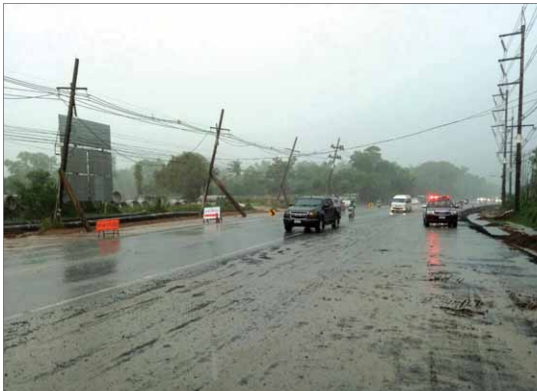
Police partially closed Cherng Talay's Srisoonthorn Road last week as power poles fell onto the road following heavy rains in the area. They were tentatively fixed. No damage to vehicles or injuries were reported. The incident, however, caused an area-wide blackout. Although power was soon restored, some people complained about not having any electricity for as long as six hours.