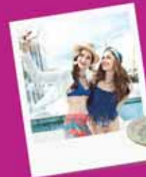
(Jungceylon beach hat)