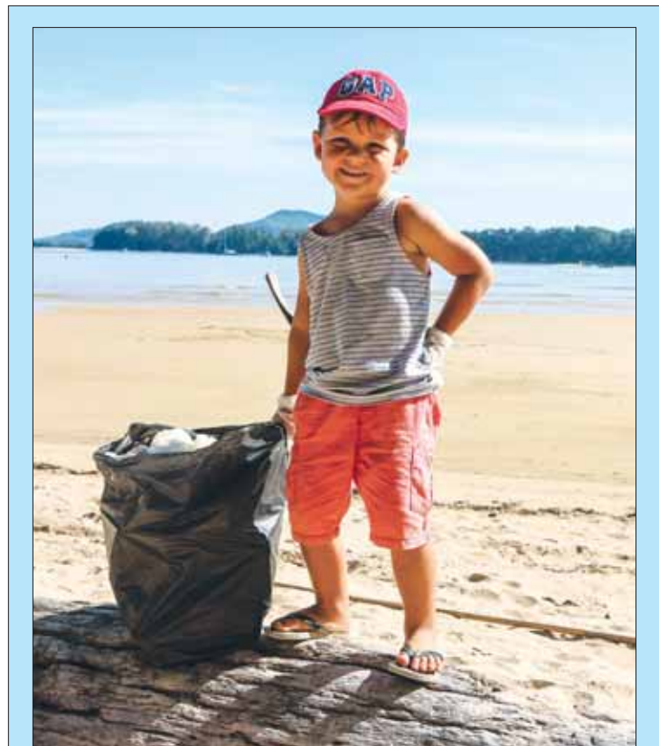
Last Friday, children from Gecko School, Thalang, joined forces with the staff of Phuket Marriott Resort and Spa, Nai Yang, to clean Nai Yang Beach. Afterwards, the kids enjoyed snacks and drinks provided by the Marriott.