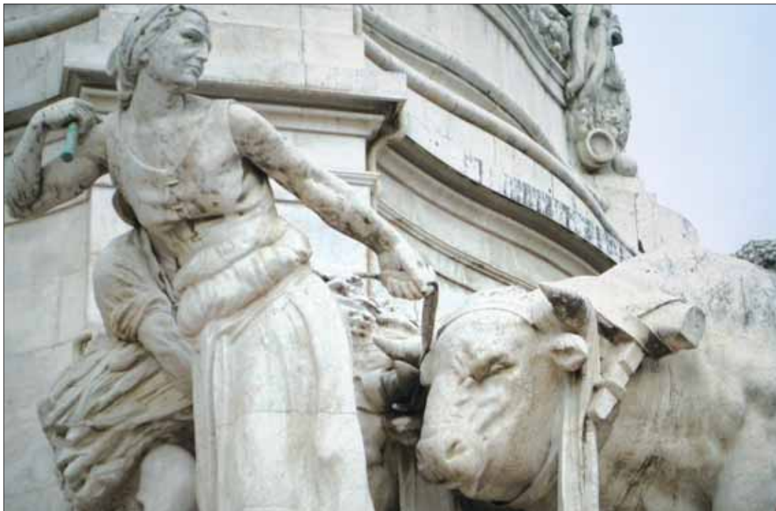
Sometimes you have to take the bull by the horns to take control of your life and not let things spiral out of control.

I have long advocated investors educating themselves and if you have read my column for any length of time you may have read some of my previous suggestions. After having read over 100 books on economics,