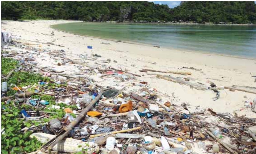
Phi Phi discharges 93 per cent of its wastewater straight into the sea.

Now, nearly ninety years on, it seems a particularly prescient observation. Of course Freud was thinking principally of mankind’s insatiable appetite for war, all too aware, in 1930’s Germany, that Hitler was cranking up his military machine. However, were he alive today, Freud would surely be aware that, despite the killing fields of war, the threat to our natural environment posed by man’s selfishness and greed, is a far more serious long-term problem, something that endangers the very existence of our planet.