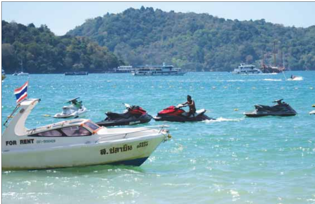
It would be a good idea to have one or two embarkation and disembarkation points.

well in Boracay, Philippines – a beach destination that welcomes approximately 1.5 million visitors per year.