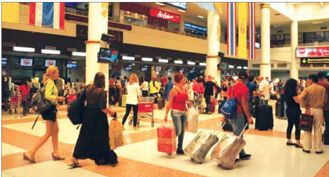
Thailand, including Phuket, experienced a record number of tourist arrivals in 2016.

Thailand, while going through a period of transition, has once again proven itself to be resilient, with tourist arrivals at record highs, a stable currency and one of the best performing equity markets in 2016 (up 20 per cent year-on-year). With elections due in early 2018 and infrastructure improvements planned, the outlook is positive.