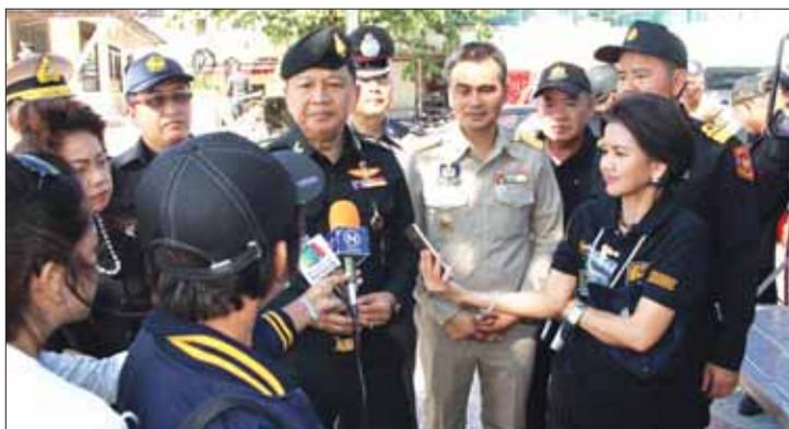
Maj Gen Pornsak visited Patong Beach to take stock of illegal parking by rental vehicles along the beach road.

"At the moment, it has been taken care of and the beach road is organized again. However, we will keep an eye on this in the future to ensure that