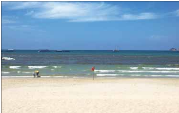
Officials say the brown water at Patong Bay can be countered by planting water hyacinths.

"We acknowledge that the nitrogen and phosphorus comes from the wastewater discharged into the sea. However, it is thoroughly treated and safe. The biological oxygen demand (BOD) is not more