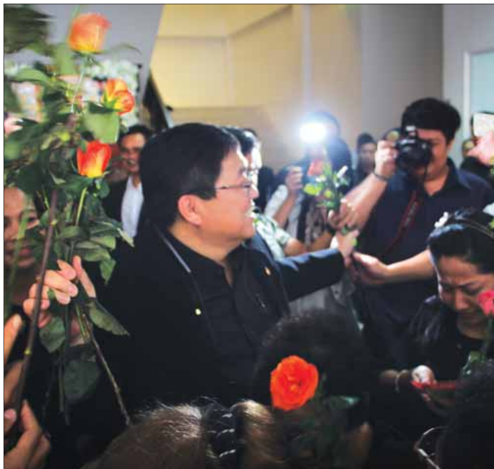
More than 1,000 public and private sector individuals visited Phuket Provincial Hall to show support for the governor's newly-launched anti-corruption initiative.

“It starts out with illegal workers being arrested and hauled down to a police sta-