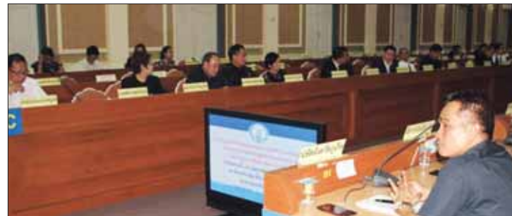
Officials at a Provincial Hall meeting called by Phuket Governor Chokchai to discuss corruption allegations.