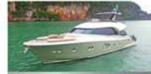
Monte Carlo Yachts 70 (2015) 2,750,000 EUR