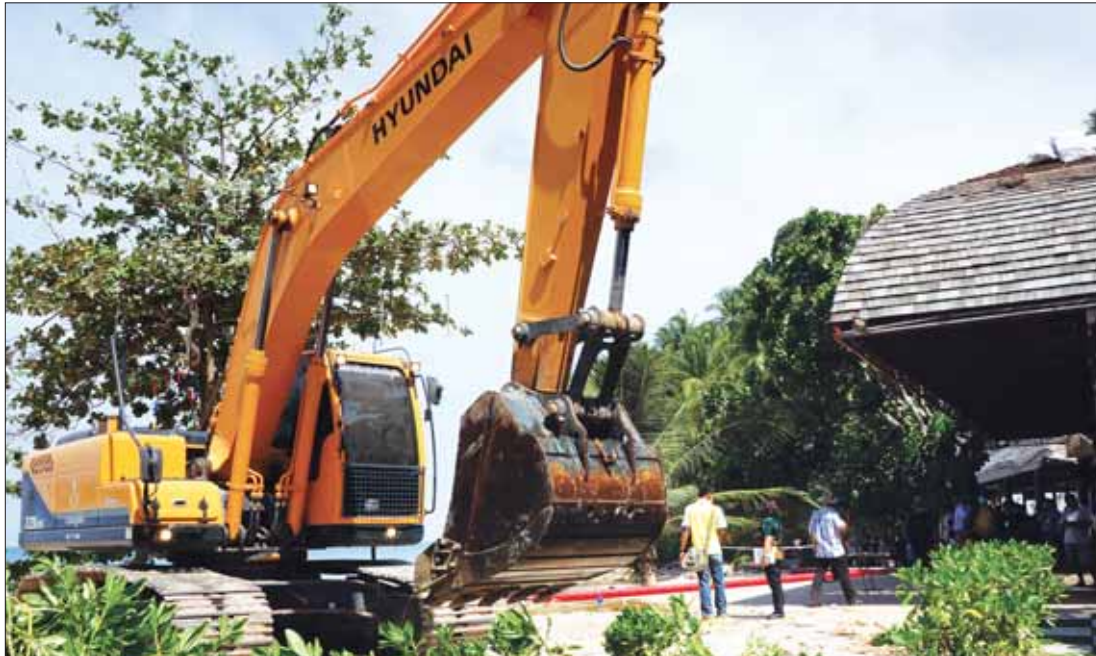
A backhoe tears down some of the last remaining buildings on Surin Beach. With the absence of beachside restaurants and clubs, a host of inland businesses have mushroomed to cater to demand. Gazette file

The high season seems different as well. Surprisingly, this time around, branded 5-star hotels did not achieve the magical 100 per cent occupancy that they usually do over the Christmas and New Year period. A quick check, both online and walk-in, showed room availability over a variety of budget, as well as branded 5 star hotels. This may also have been affected by the strong Thai baht against the weak Euro, US dollar and British pound, as it is now 10-20 per cent more expen-