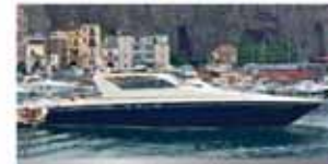
Leopard 23m (1999) 450,000 EUR