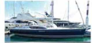
Jeanneau Sun Odyssey 50 DS (2012) 265,000 EUR