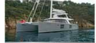
Sunreef 60 Loft (2016) 1,490,000 EUR