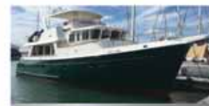
Selene 59 (2007) 990,000 USD