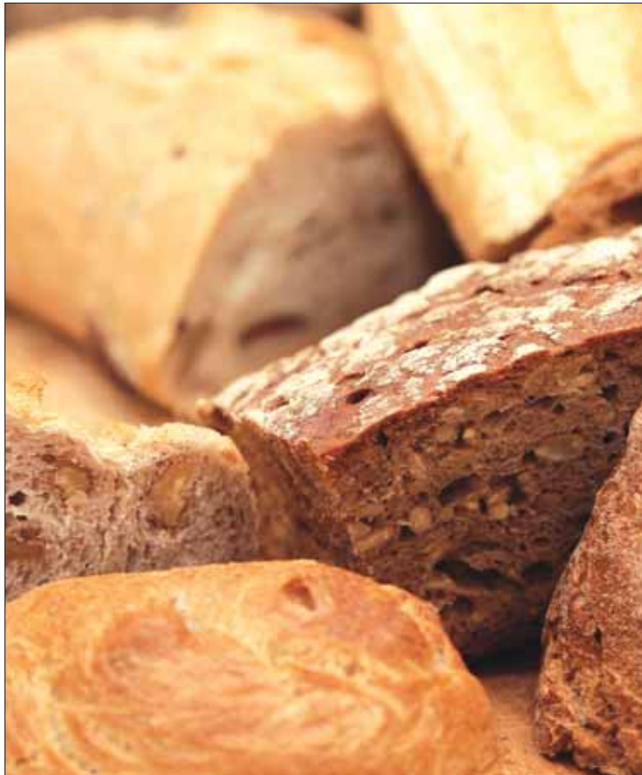
Left: Low-carb and gluten-free, but still delicious, especially with poached eggs and avocado on top. Right: Nutritional breakdown for an average slice of low-carb, gluten-free bread prepared according to the recipe provided.

If you want, you could add some nutmeg and curcuma as well, according to your taste and requirements.