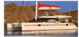
Sunreef 62 (2007) 850,000 USD