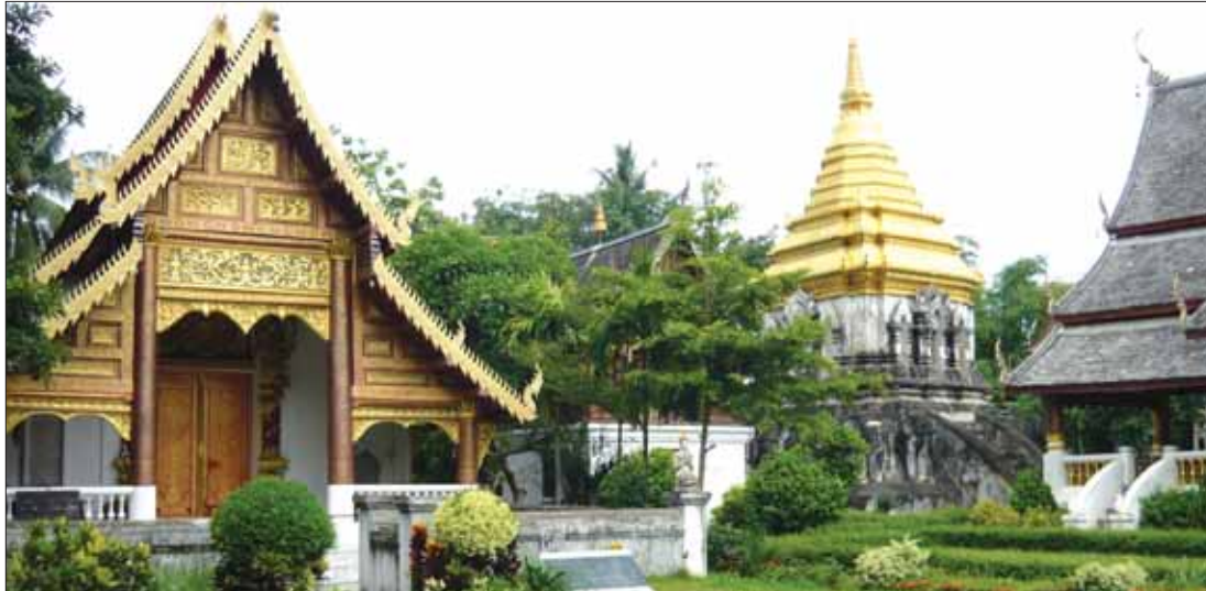
Chiang Man temple is one of the oldest temples in Chiang Mai, the 'new city'.

In 1291, King Mengrai waged war on the Kingdom of Haripunchai. Yi Ba, the last