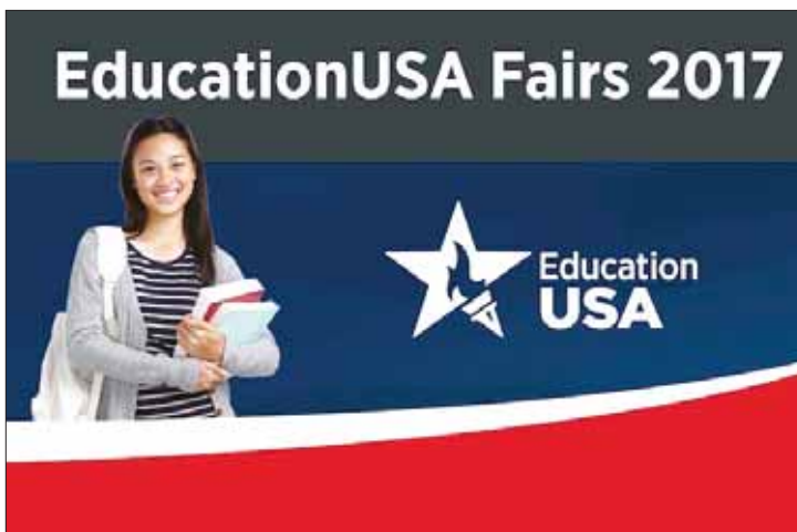
Entry to all EducationUSA Thailand fairs is free.

They will also have the opportunity to speak directly with US Embassy Consular officers regarding the student visa process.