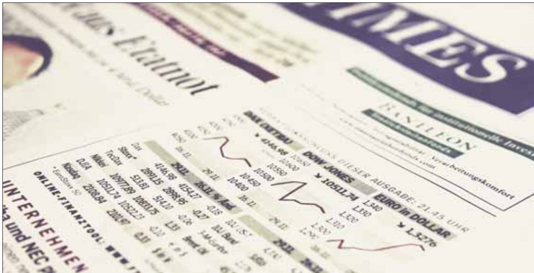
While Dow 22,000 may sound bullish, its only 8-10 per cent higher from mid-January levels.

The problem with this theory is that while there may have been a January Effect in the 1940s when stock markets were much smaller and more inefficient,