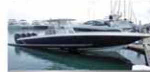
Fountain 38 CC (2011) 215,000 USD