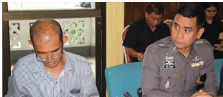
The provincial committee denied the request.