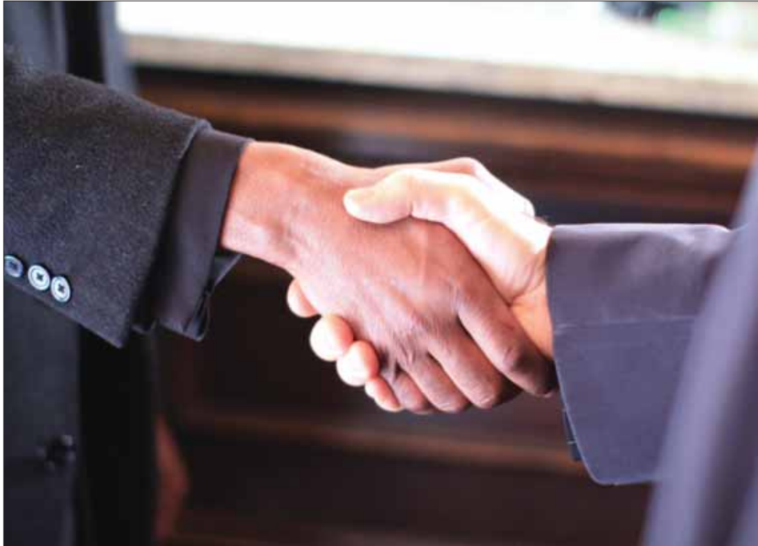
As people's social media attention spans get shorter, the critical advantage for businesses will be building real relationships with their clients and partners.