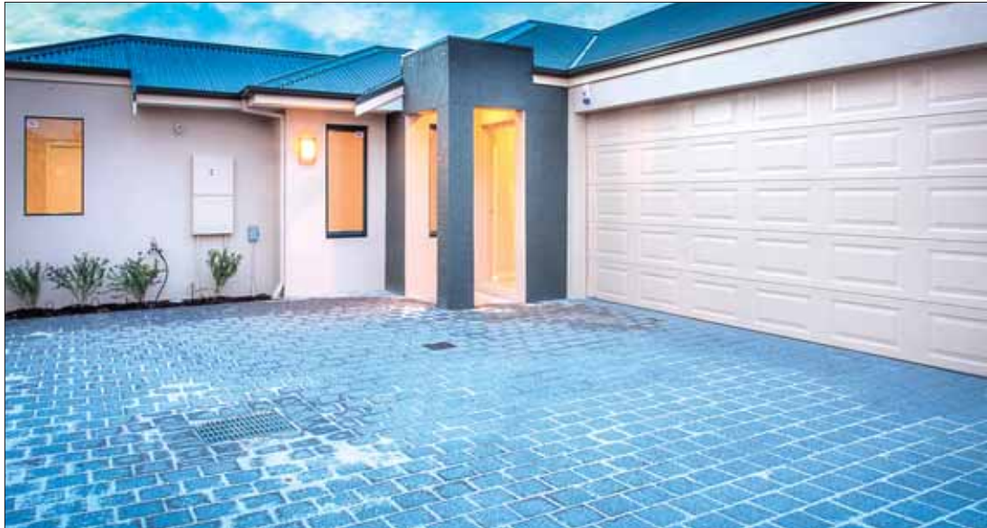
First impressions are important, so make sure that the exterior of the property is up to standard and the garden is neat; gutters cleaned, windows sparkling and so on.

1. Your property should always be available at short notice for viewings. If that's inconvenient, leave a key with the agent. Remember, the buyer has little time and lots of other properties to see, so you must