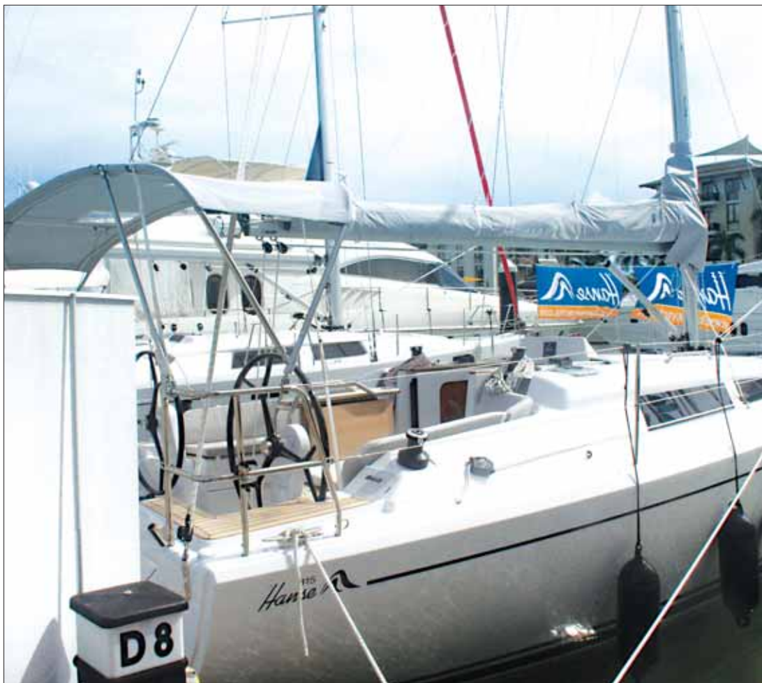
The Hanse 315, that won four awards last year, pictured moored here in Phuket.

thrives, it's encouraging to see a resurgence of the sail boat scene also. This resurgence has been led by the island's home-grown boat building industry. However, in the last few weeks – what with all the back-to-back marine industry activities – it's been very clear to all willing to wake up from their post-festive season slumber that