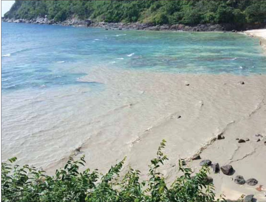
A building contractor, KMIT Construction, was let off with a warning for discharging murky brown rainwater onto Tri Trang Beach on January 13. The waste was coming from a construction project being undertaken in the area, confirmed the Patong Mayor.