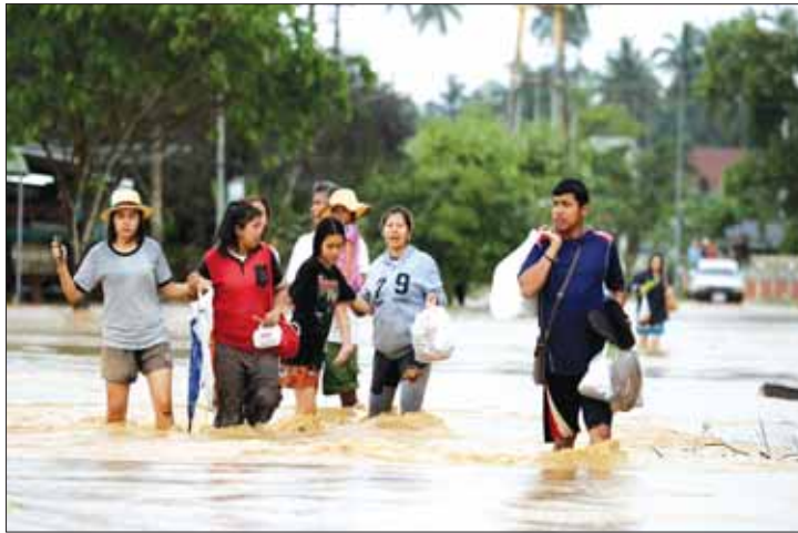
More than a million people have been affected by the floods, and many rendered homeless.

global and local. On a global level, the main culprit is global warming. Rain and snow – or precipitation – basically come from two sources: 60 per cent from the world's oceans and 40 per cent as moisture 'recycled' over land masses. But the amount of moisture in the heavens is largely determined by the