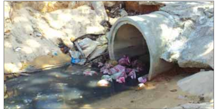
Untreated wastewater being discharged near Surin.

CHERNG Talay officials have asked hotels and vendors to stop the discharge of wastewater onto Surin Beach.