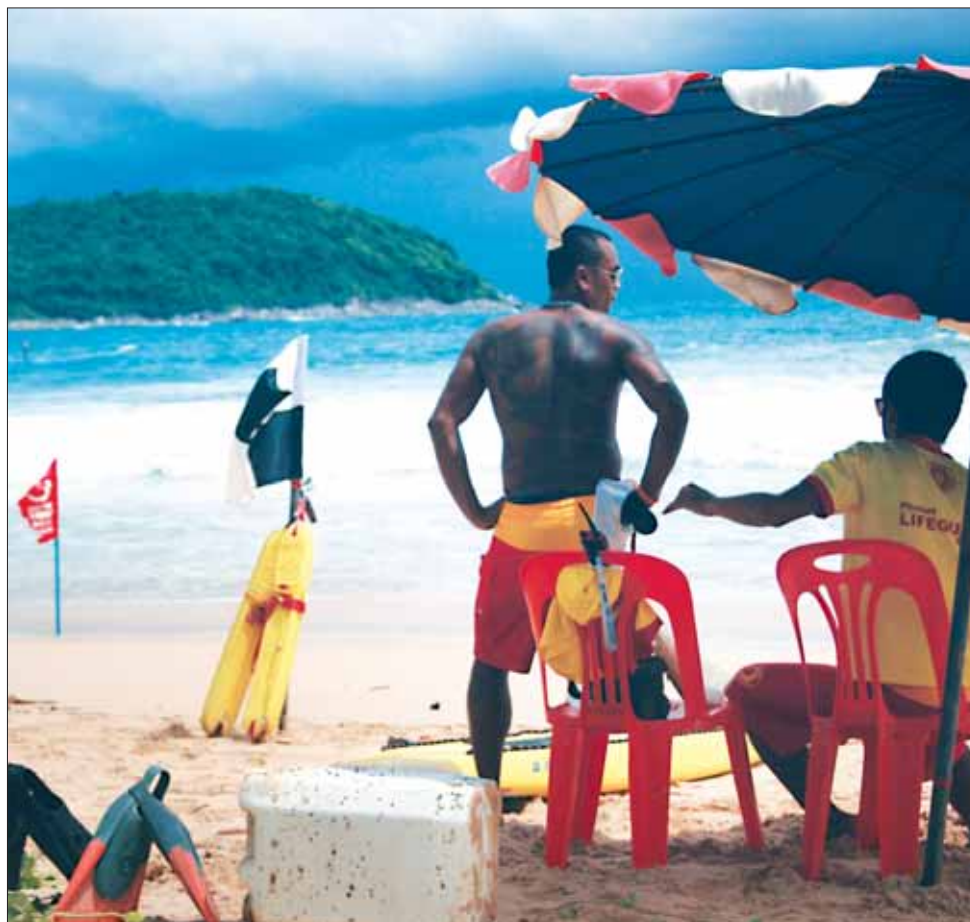
PLC Chief says there will be no delay in signing the contract this year, thus no gap will occur between expiration of the old contract and enforcement of the new one.

“ISLA stands ready to assist in the development and advancement of professional lifesaving in Thailand. We can provide additional training and rescue equipment free of charge to help reduce the high number of preventable drowning cases in Phuket, but we (and the Thai Life-