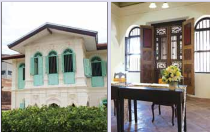
Top: A 100-year-old abandoned Sino-Portuguese style distillery in Kathu. Bottom: The restored and repainted building after completion of the repair work by Kathu Municipality. The area around the building was turned into a public park. Kathu Mayor Chaianan Sutthikul says that the rich heritage, architecture and culture of Kathu will help promote tourism in the area.