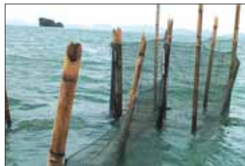
Fishing mazes off the Krabi coast.

KRABI locals were outraged after a social media post showing a dolphin calf dying in an illegal coastal-fishing net system went viral on September 18.