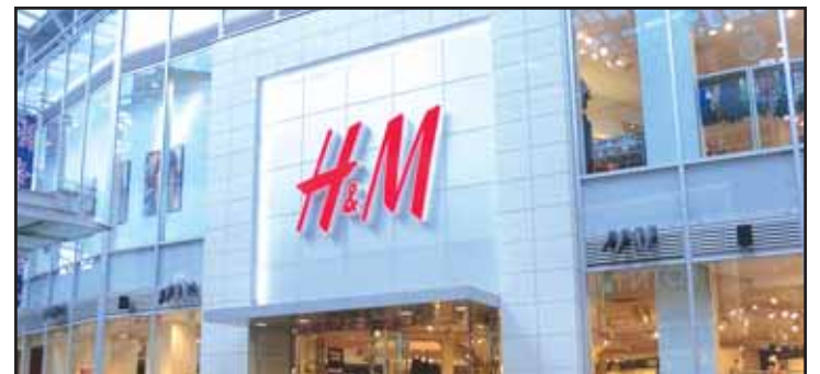
Many businesses, such as Swedish clothing company H&M, choose to have a physical as well as an online presence.

In the past, retail products typically followed the indirect channel of distribution, that is, from manufacturers to distributors to retailers to consumers. The advent of social media and e-commerce has made this process easier and more convenient. While brick and mortar stores are still widely used, a wide variety of products and services are now also sold through websites or