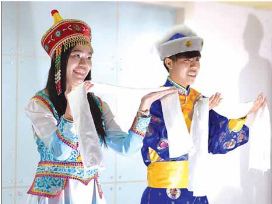
Students show off traditional Chinese fashions on the catwalk.

The Faculty of International Studies at Prince of Songkla University and the Confucius Institute of Phuket put on an afternoon of cultural performances for the ASEAN Extravaganza on September 7, at the university's Phuket Campus. The line up of performances representing ASEAN nations included a traditional costume fashion show and classical music from Thai, Chinese and Indonesian bands.