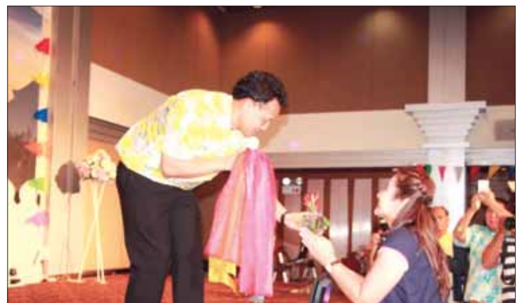
A party guest hands the governor a red rose as he croons on stage.

Please call 076 372 400 to make your enquiries and bookings. | Email: fb-phuket@banyantree.com | banyantree.com