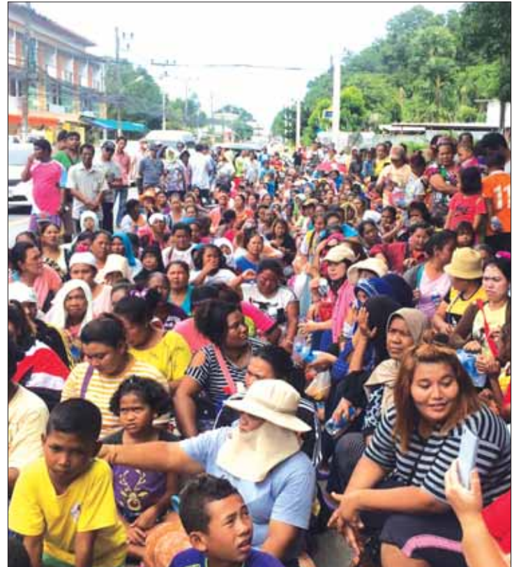
Sea gypsies intercepted by authorities.