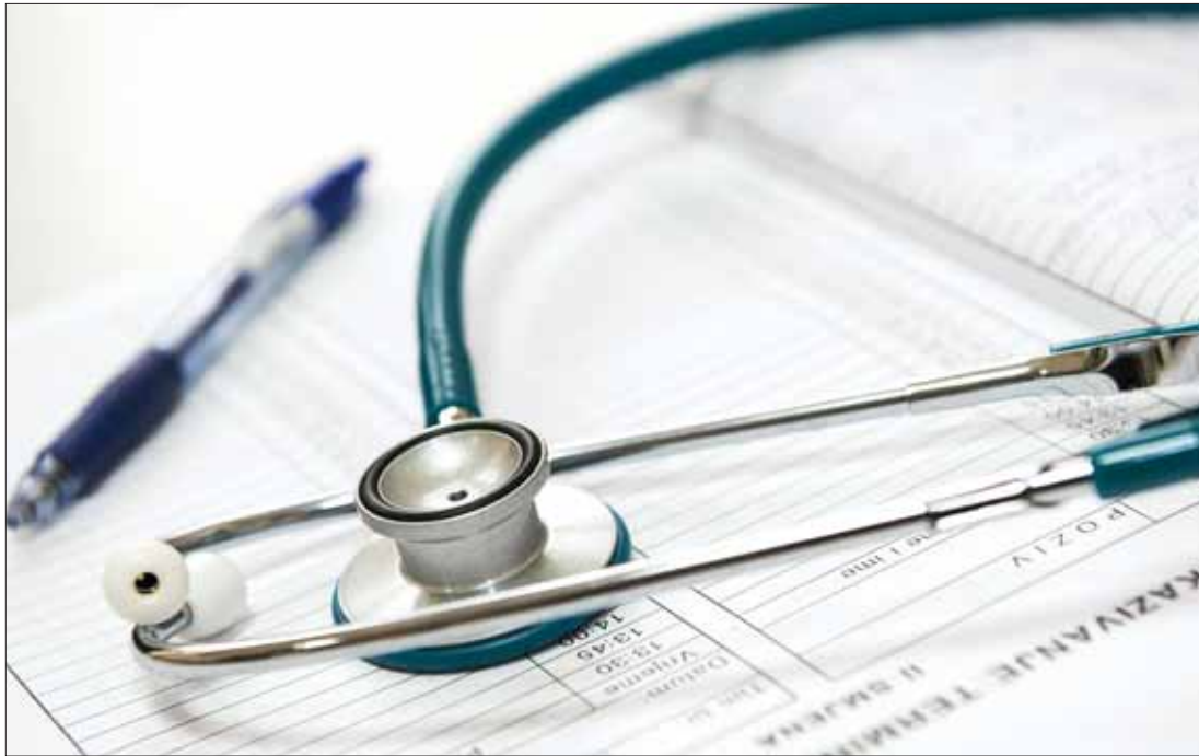
About 300 users have so far registered to use the system to check their records online.

"There are a total of 29 state health centers in Phuket that this system was introduced to. The users, including doctors, officers and patients, can use this system to access their