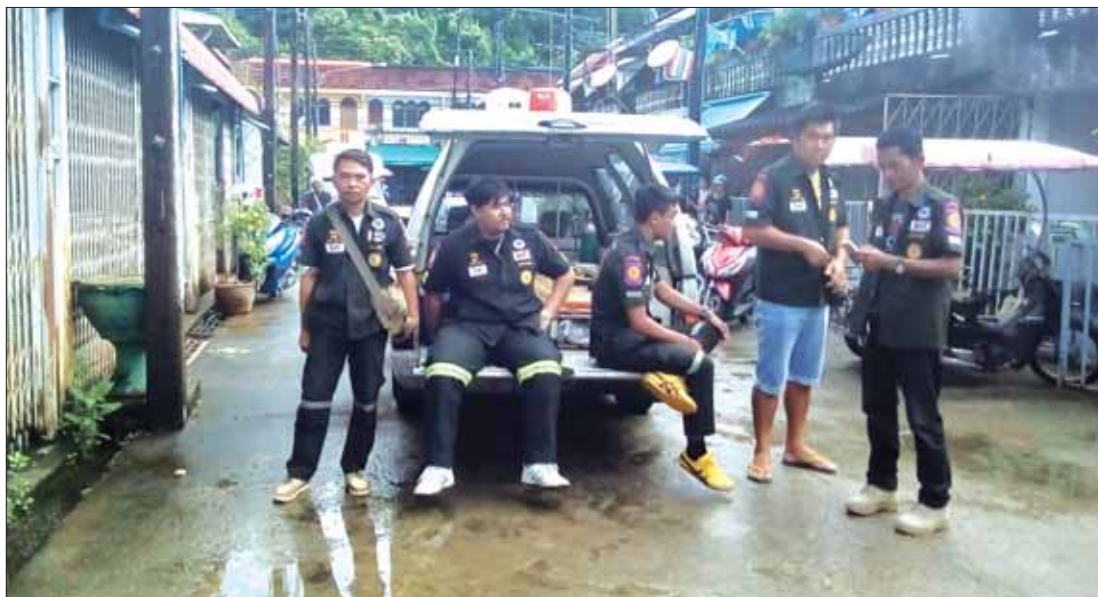
Rescue workers wait outside the family's two-storey house.