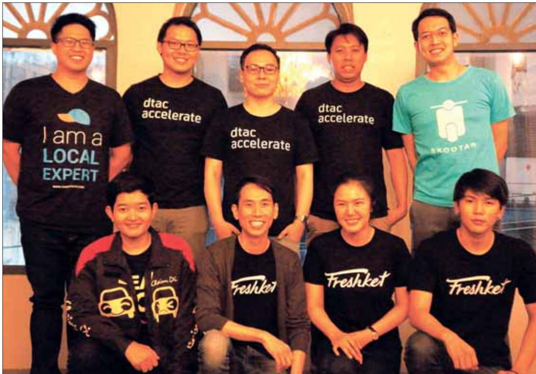
Representatives from Dtac Accelerate and successful start ups Skootar, Claim Di, Take Me Tour and Freshket joined the Startup Thailand event in Phuket on September 16.

Representatives from Dtac and the start ups were on hand at the event to offer advice and inspire small to medium sized enterprises (SMEs) by sharing know how and experience using digital technology and communication services to reach out to cus-