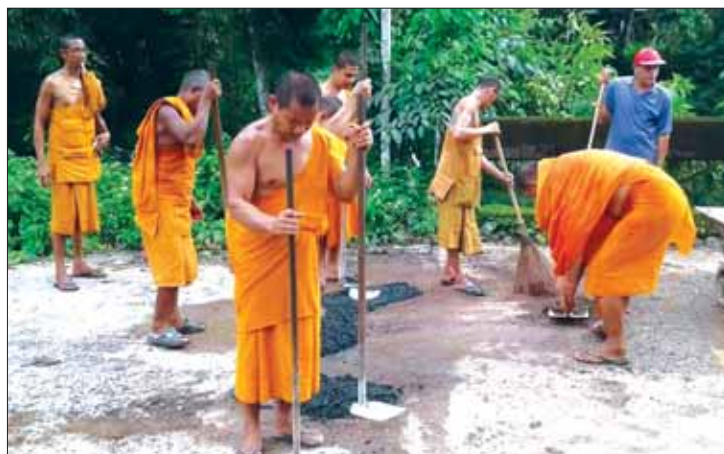
The Abbot of Suwan Thararam Temple led a team of nine monks and locals in repairing the pot-holed road.

"We had been asking local officials to fix the road for