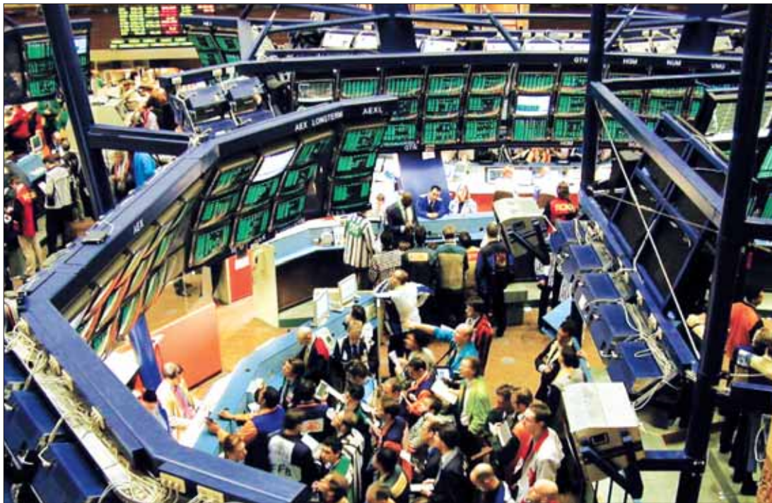
Worldwide news continues to be negative, but markets seem to ignore much of it.

The iShares MSCI Emerging Markets Index ETF (NYSEARCA: EEM) appears to be breaking out while the iShares MSCI ACWI ex-US Index Fund (NASDAQ: ACWX) has yet to do so. The SPDR STOXX Europe 50 ETF (NYSEARCA: FEU) has