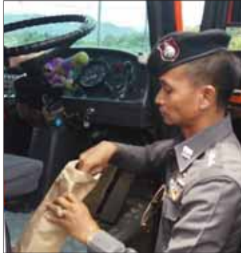
An officer searches the bus.