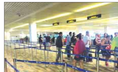
Passengers wait for immigration in the dimly lit terminal.

The official said it would take up to three months until new computers arrived.