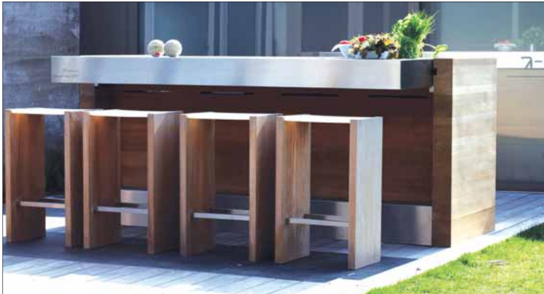
If left alone, teak's golden brown color will change to a lustrous silver-grey within a year.

Teak is the first choice for long lasting furniture and its durability makes it a favorite for patio and deck furniture.