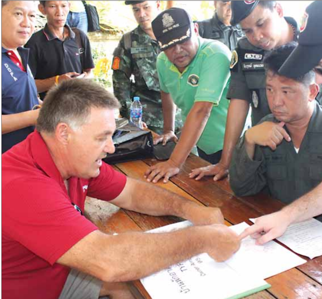
Acting on a complaint, land inspectors carried out a raid and demanded to see the land documents.

"He failed to present us with any land ownership documents for the estimated 20 rai of land that the development sits on,"