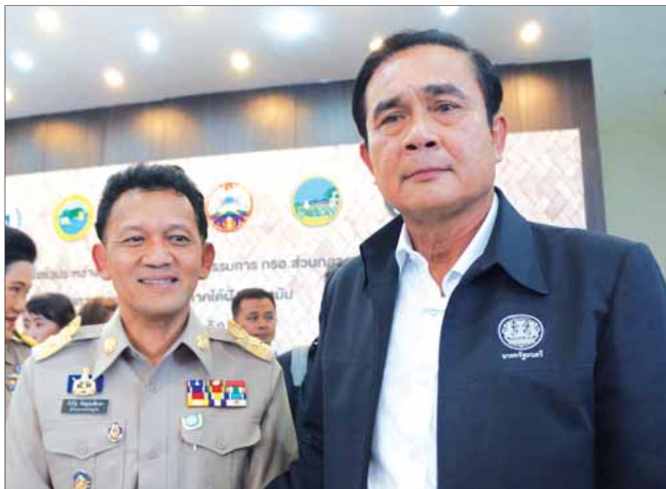
PM Prayuth Chan-o-cha (right) with Gov Chamroen Tipayapongtada.

The decades-long disputes between the Rawai sea gypsies and developers in the island's southernmost municipality had