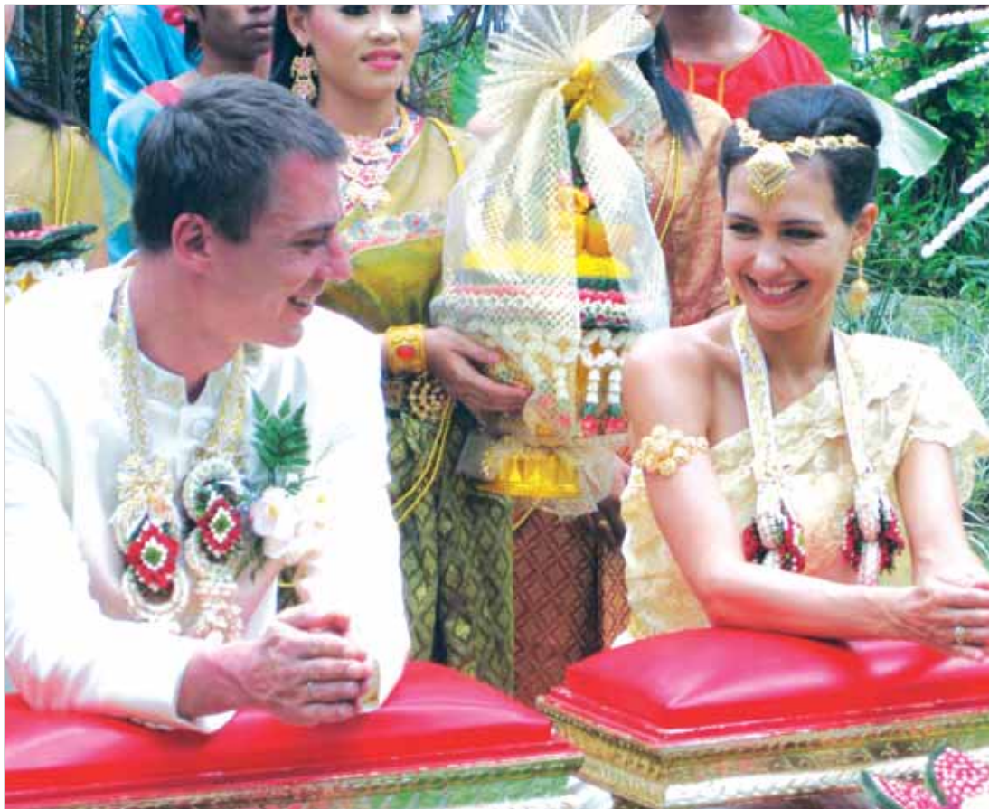
It is important for foreigners to understand the Thai concept of dowry before saying 'I do'.

Depending on the family's financial situation, the family may choose to return the sin