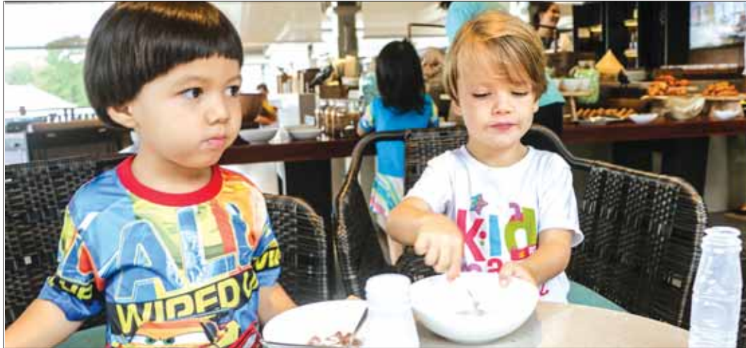
RAINED OFF: Gecko Nursery School kids enjoy breakfast at the Marriott.

Children from the Gecko Nursery School Phuket visited the new Phuket Marriott Resort & Spa in Nai Yang Beach on September 16, as part of an environmental awareness project jointly organized by the school and the resort in north Phuket. Rain dashed the organizers plans to get the kids and their parents cleaning the beach so they were instead treated to breakfast at the resort's lobby lounge.