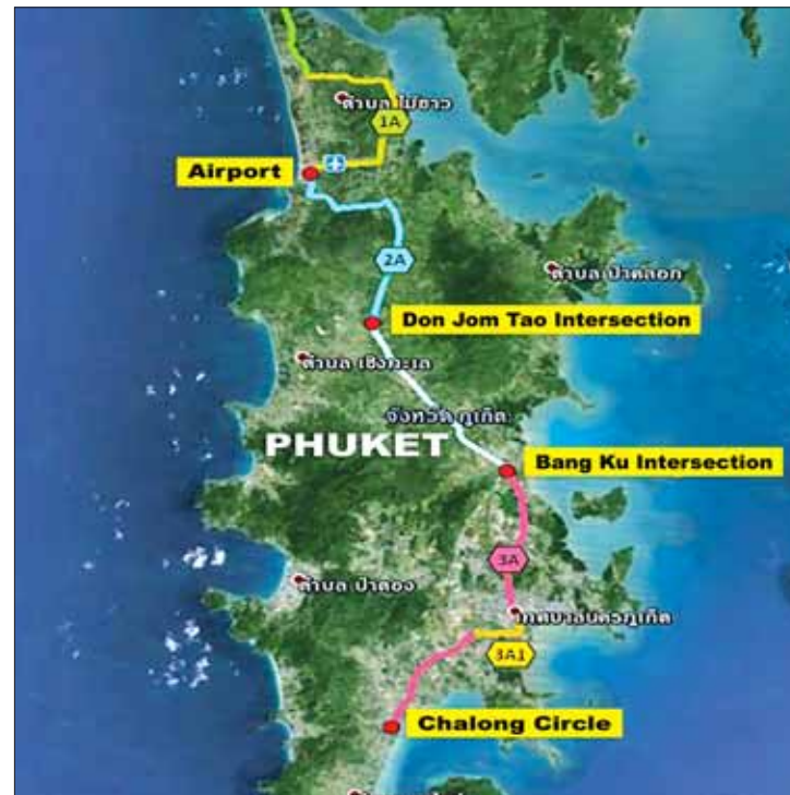
An overview of the proposed light rail route.