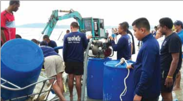
It took officials about 2 weeks and multiple attempts to salvage the yacht.

OFFICIALS and volunteers on July 23 managed to successfully salvage a yacht that had been grounded at Ao Nang Beach since July 6, after breaking free of its anchoring during a storm.