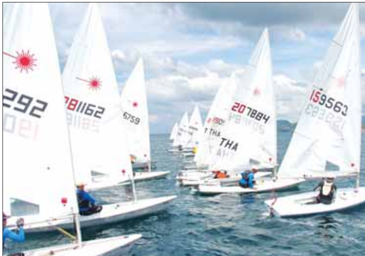
The regatta also has a very strong youth dinghy fleet that it supports with a year-round racing series to help foster the long-term appreciation of sailing.