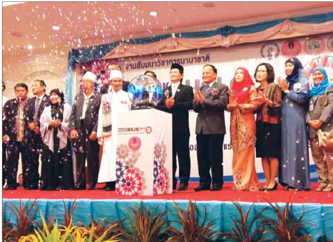
The Phuket Islamic Council launches a drive to encourage local businesses to benefit from Thailand's multi-billion baht halal product export industry.

About 30 per cent of Phuket's 386,605 residents are Muslim and there are more than