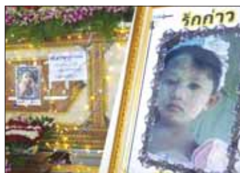
The girl was only four years old.

money for the funeral," he said. "I had to borrow more than 10,000 baht for the funeral. We need compensation, or we won't burn her body. We want to be treated justly, not differently just because we are migrants."