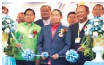
Ribbon cutting to open TMCECA's Phuket branch.

"There are a lot of business industries in Myanmar that