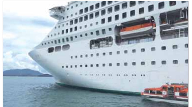
Port construction issues were discussed on July 24.

Ms Pataraporn said the TAT estimates the number of cruise ship passengers to Samui to increase from an estimated 1,000 to 3,000 tourists per ship annually.