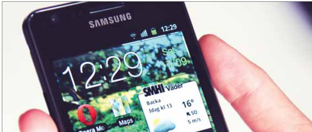
There is talk that Apple and Samsung might move from the current LCD materials for screens to organic light emitting diode (OLED) based screens.

While the biotech sector has given investors a less than stellar performance lately, Ligand Pharmaceuticals could have an action-packed 2016 with potentially five new product approvals from partners, advancements and expansion of its license portfolio and revenue growth forecasted to be approxi-