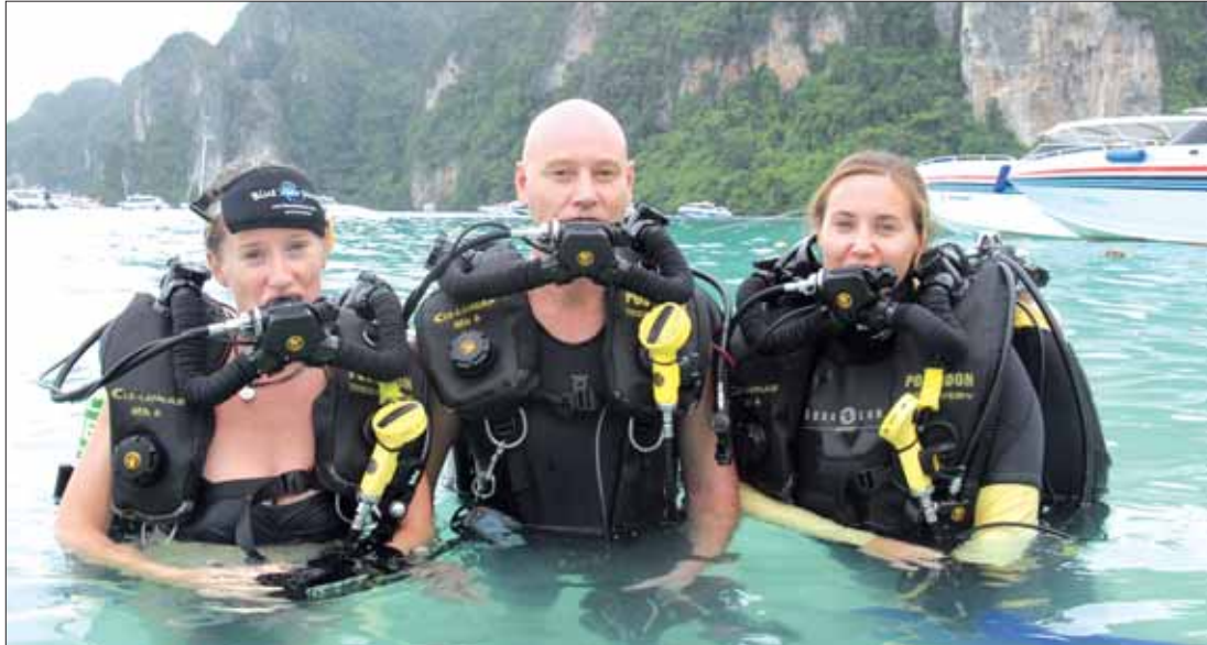
The advantage of a drawn out DM course is that you work with several instructors.

It's the proverbial tortoise versus hare, where the real winner is some amiable creature in between.