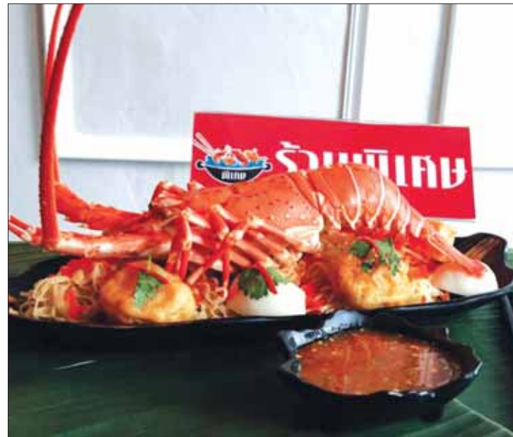
More than 30 local eateries from all over Phuket are participating in the month-long Lobster Festival.

THE Phuket Lobster Festival 2016 announced its arrival with a splash at a press conference held at Tukabkhao Restaurant in Phuket Town on July 26.