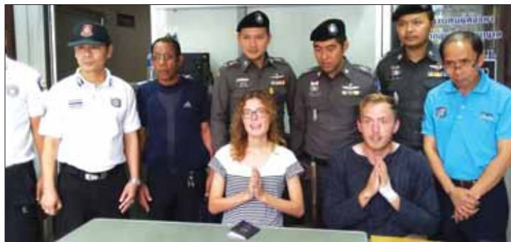
The pair apologized for their actions.

"The woman is a 21-year-old exchange student and the man is a 24-year-old tourist," said Lt Col