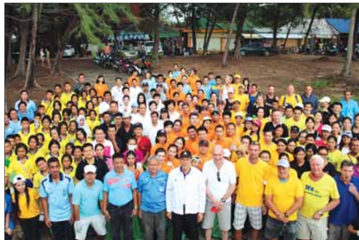
Nearly 300 volunteers removed two tonnes of trash from Nai Harn Beach last weekend.

The OrBorTor along with their team, staff from Atmanjai, Friendship Beach Resort, Old Dawg, Serenity Resort & Residences, SunSuri Phuket, The Mangosteen Resort & Spa and Chivitr worked with children and mentors from the Watsawangarom School, Rawai. They were also joined by local residents and several tourists.