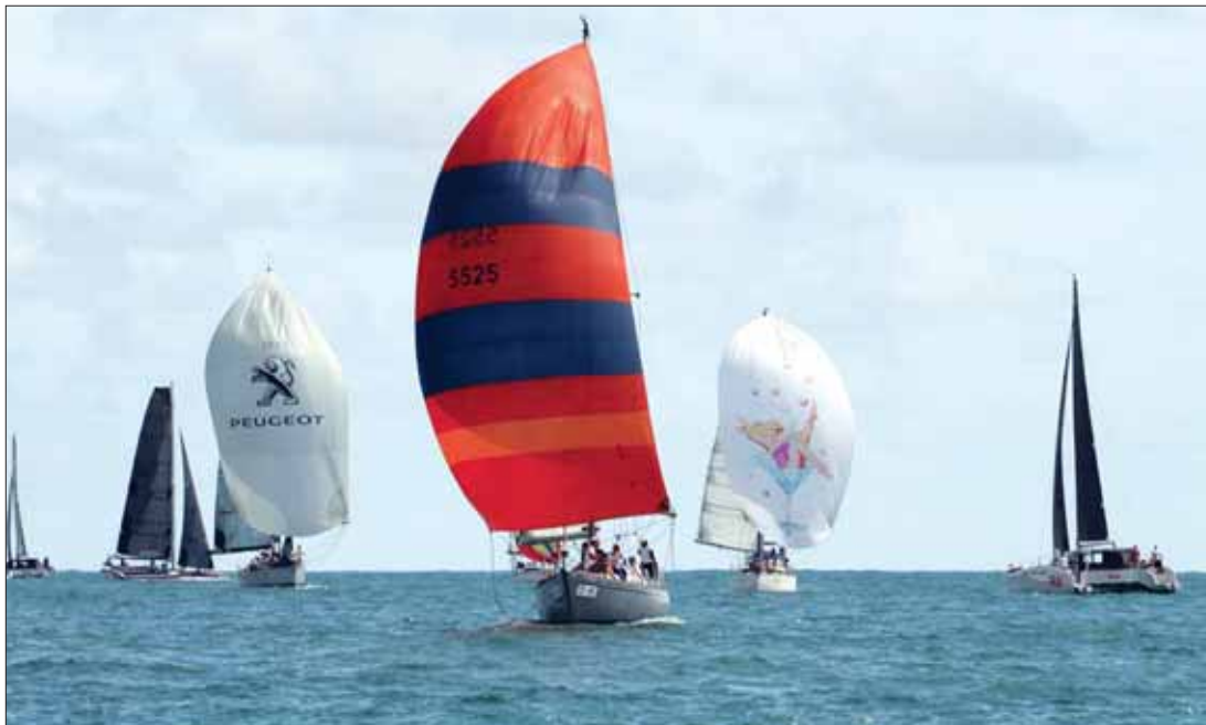
Remington on their way to winning the Cruising/Charter class on Race Day 4.