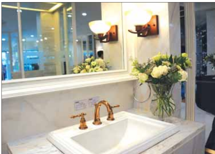
Kohler is pre-ordering popular products to ensure they don't run out of stock.