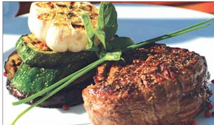
I feel at home in Phuket for several reasons, but finding affordable beef to cook definitely belongs somewhere near the top.

It is important for us to help each other and rectify the situation – ultimately, it is our national duty to improve Thailand as much as possible.