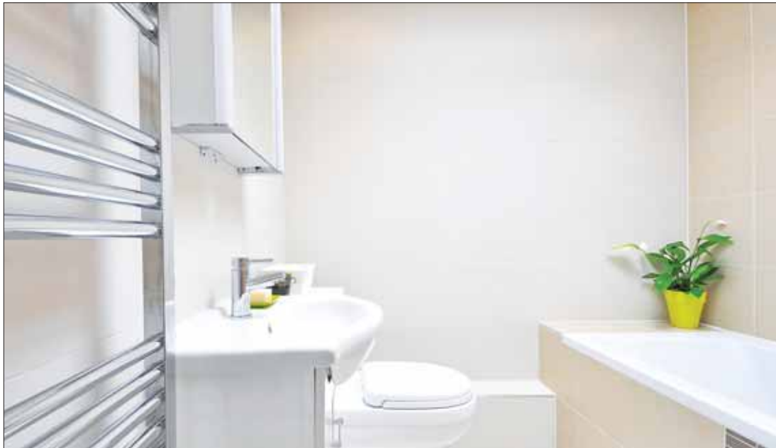
Every bathroom has a different setup that needs to be looked at with a brand new attitude and a fresh bouquet of ideas.

The first thing to consider is that you have two lighting sources, and both should be considered. Windows and skylights, that pipe sunlight into a bathroom should be used whenever possible. There is no substitute for brilliant sunlight streaming into a bathroom space in the morning. Windows will let light in no matter which direction they face.