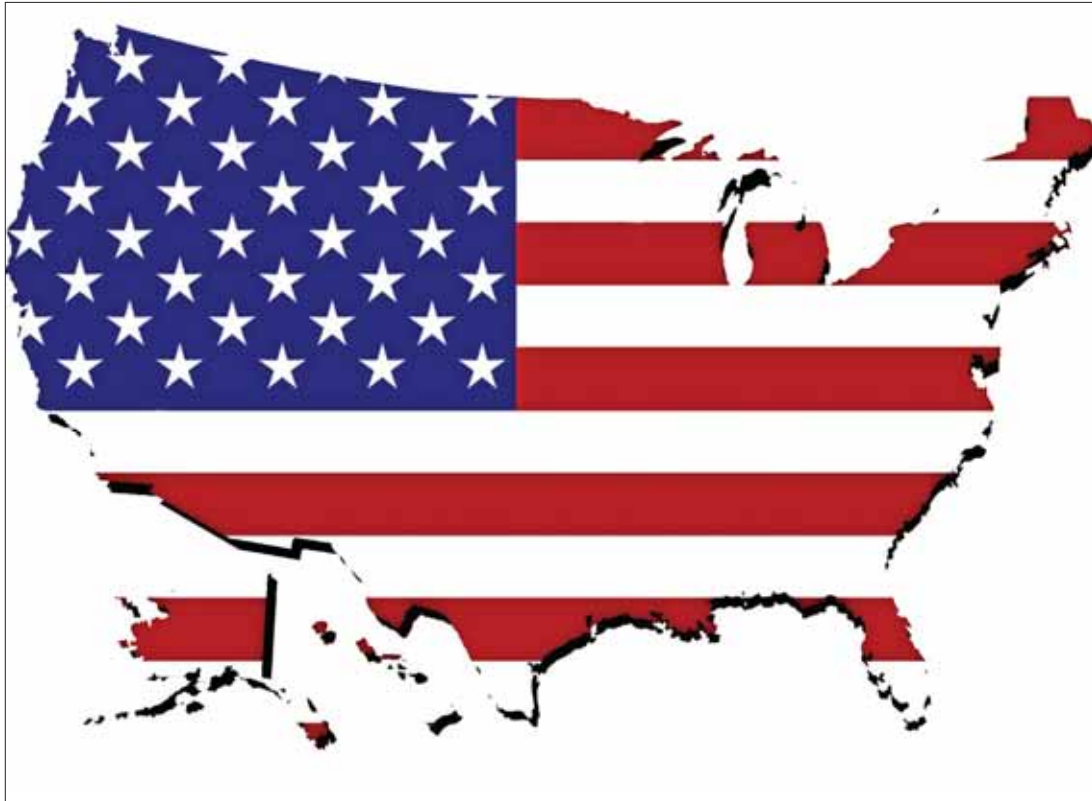
At the US Embassy, the consular officer is given full discretion to determine whether or not an applicant qualifies for the visa.

At the US Embassy, the Consular officer is given full discretion to determine whether an applicant qualifies for the visa. When the officer states that they have evidence that the applicant has committed an act that prevents them from issuing a visa, the burden of proof shifts to the applicant to prove that they have not committed the action. The officer will attempt to obtain a statement from the