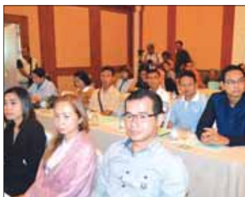
Hoteliers at the conference.

The vice-governor spoke of the need to enhance safety measures in the wake of the Erawan Shrine explosion in August of last year, and added that the incident had smeared the image of Thailand as a peaceful tourist destination.