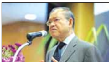
Mr Supachai at the Thai Chamber of Commerce.

BREXIT, the Arab Springs, the Orlando shooting and the migration crisis may seem disconnected but in Supachai Panitchpakdi's grim interpretation they mark the end of the long-existing global economic landscape and the birth of a new, closed trade regime.