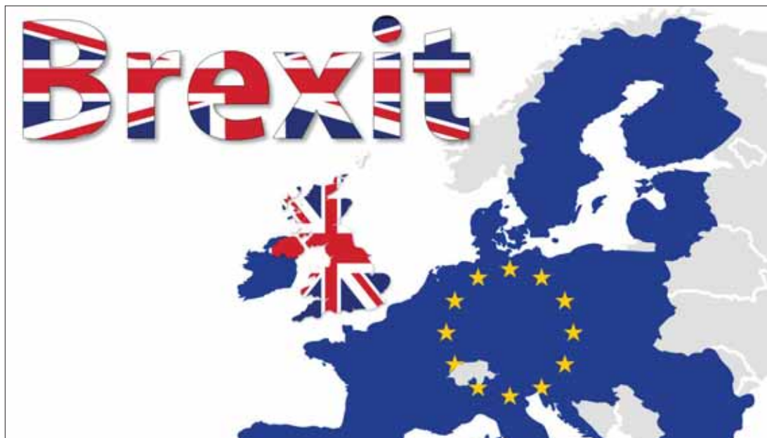
The EU referendum resulted in 51.9 per cent of British voters opting to leave the EU.

Each and every time there were predictions of doom for the markets – only to see them remain intact or eventually recover. And, while the US economy is still feeling the lingering effects of the collapse of