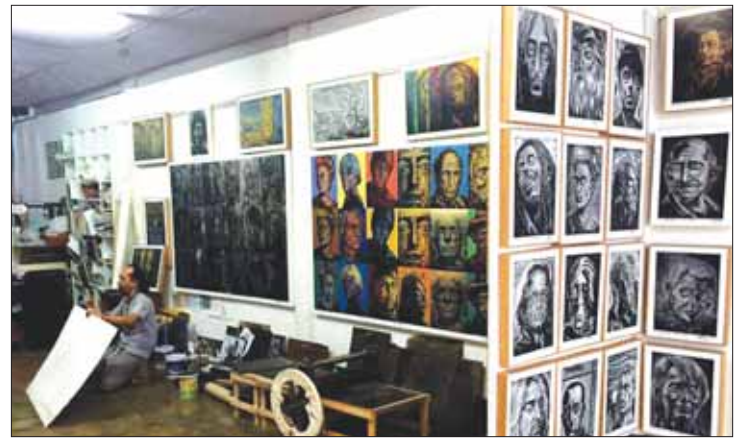
Walking about Old Town can be quite relaxing, despite the constant buzzing of crowded telephone wires.

In order to improve the overall tourism environment in Phuket and in Thailand, the Chinese Consulate General would like to work together with the local government to promote friendly relations between the two countries.