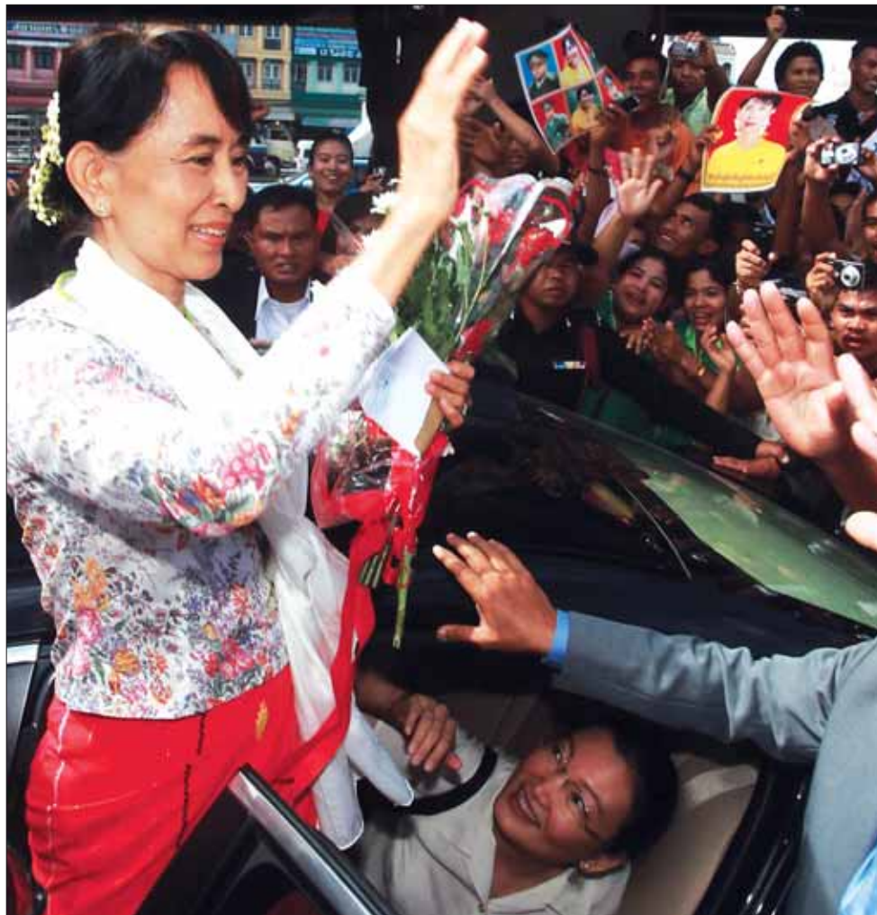
A large number of Myanmar nationals flocked to see Aung San Suu Kyi when she visited Thailand last week to strengthen bilateral ties between the neighboring countries.

"Construction work is plentiful all year round for migrant workers in Phuket. They don't have any problems with money at