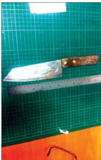
The weapon allegedly used in the incident.

times – once in the abdomen, once in the right shoulder and once in the back," confirmed Col Umpolwat.