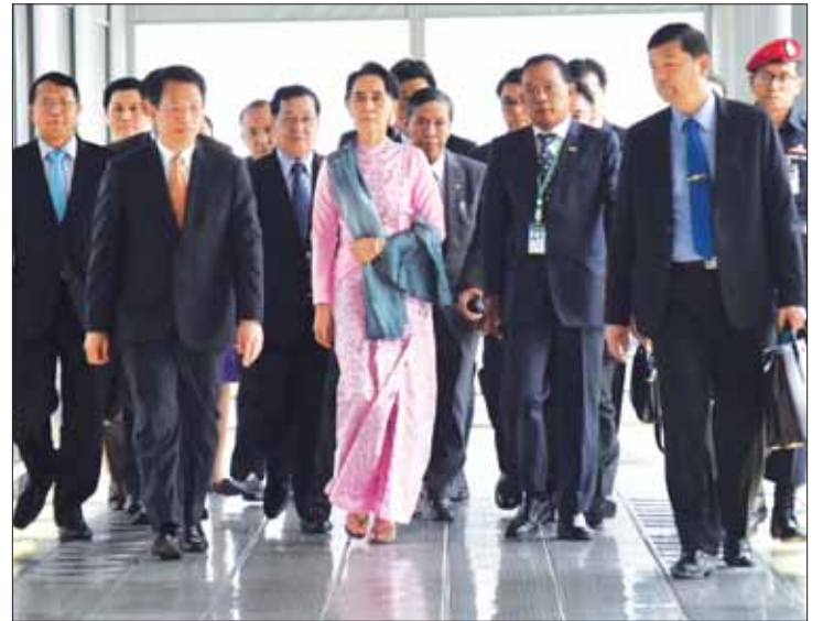
State Counselor of Myanmar Aung San Suu Kyi flanked by government officials after her arrival in Bangkok on June 23.