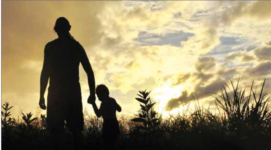
A non-Thai prospective parent must obtain a police clearance from their home country and the clearance needs to be certified by the Ministry of Foreign Affairs.

In an adoption, the legal rights of the biological parents are terminated and the adoptive parents assume full custody over the child. The adoptive parents are given all of the rights and responsibilities that once belonged to the natural parents. Once the adoption has been finalized, the court's role