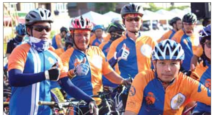
About 700 cyclists participated in the two-day event organized by the Kathu Municipality Office.

Bikers started off at about 4pm, escorted by the police as well as several medical personnel to ensure that emergency assistance was at