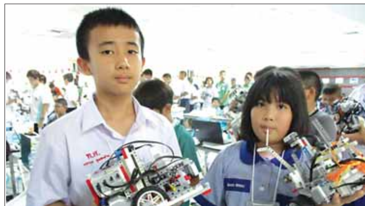
Students showing off their robots at the regional competition held at Phuket Rajabhat University last month.

THE World Robot Olympiad 2016 (WRO) competition was held at Phuket Rajabhat University (PKRU) on June 23-24. The competition was organized by Gammaco (Thailand) Co Ltd, in conjunction with PKRU.