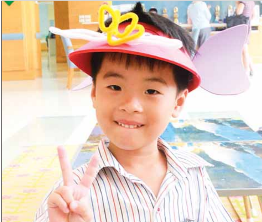
A young participant shows off an elephant cap, which he made himself.

Youngsters from around the island gathered at Phuket International Hospital recently to have fun making elephant caps. The Small Inventors day was held to help kids develop their imagination. The hospital will be staging another free event for local kids on July 9.