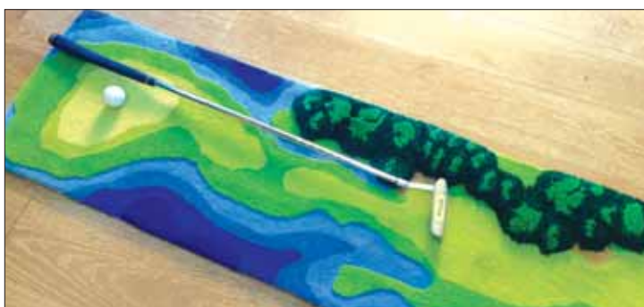
Tai Ping has built its reputation on employing highly skilled weavers to design custom carpets.

Thailand Carpet Manufacturing Plc began business under the brand name Tai Ping in 1967 and has grown to become one of the world’s leading carpet manufacturers; listed on the Stock Exchange of Thailand (SET) in 1994 and boasting control of more than 65 per cent