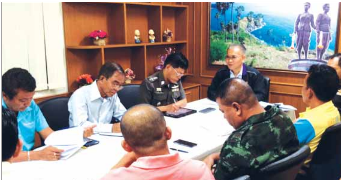
Taxi driver representatives meet with PLTO officers on June 23. The taxi representatives turned down the PLTO's recommendations.