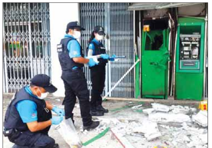
A bomb detonated at an ATM in Pattani. A series of bombings hit the southern province over the June 26 weekend.

Gen Tanongsak has said security forces will step up