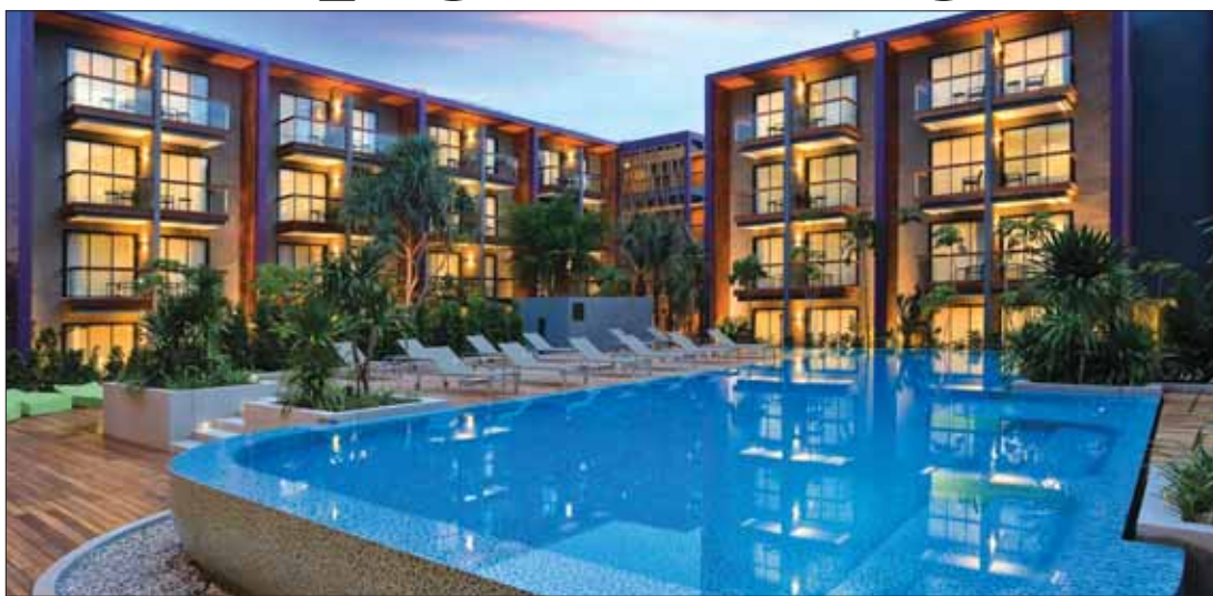
The Holiday Inn Express Phuket Patong Beach Central Hotel (above), jointly developed by IHG and Kebsup Group, opened in 2012. The partners plan to open Hotel Indigo Phuket Patong in 2018.

"We are delighted to be launching our Hotel Indigo brand in the Patong Beach town with our partners Kebsup Group Company Limited to