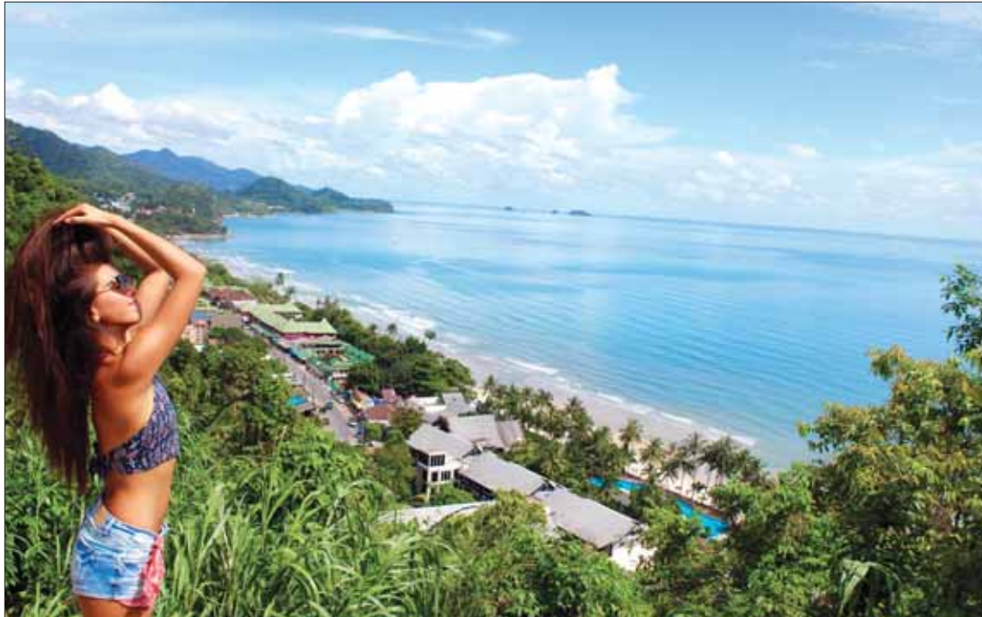
Footloos is an online marketplace, much like Airbnb, dedicated to active and wellness tourism on popular tropical island destinations in Asia.

Founded in January and launched in June after 6 months in development, Footloos marketplace is in the midst of establishing partnerships with over 500 businesses in seven locations across Thailand: Phuket, Koh Samui, Koh Phangan, Koh Tao, Koh Phi Phi, Koh Lanta and Koh Chang. And until Footloos launches late July for travelers to make bookings, they welcome all interested businesses to join the Footloos movement.