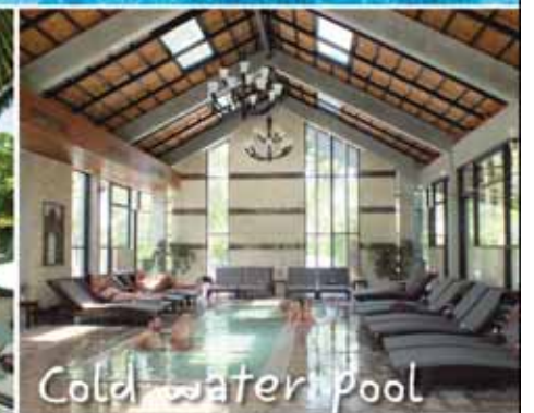
Cold water pool

OUR FACILITIES INCLUDE FULL BEACH RESORT, 2 RESTAURANTS, 2 HOT SPRING POOLS, COLD WATER POOL, EXPANSIVE SWIMMING POOL, GORGEOUS PRIVATE BEACH, FULL SERVICE SPA, FITNESS ROOM.