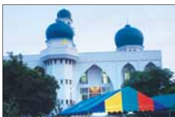
Special eid prayers are organized all over Phuket.

On the morning of Eid-al Fitr, Muslims visit the mosque for prayers. After praying, it is traditional to make amends with everyone around you, to