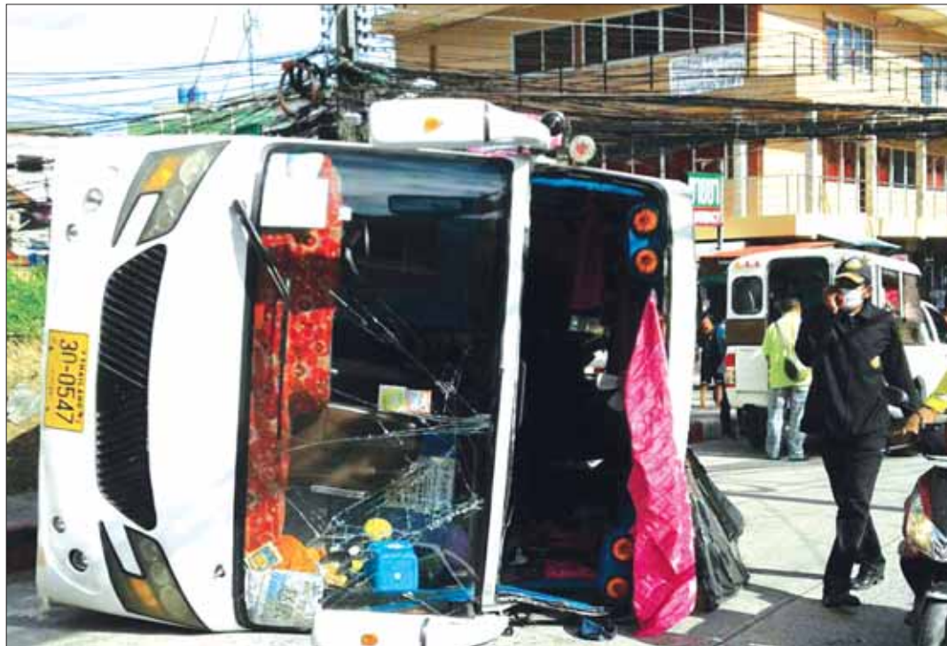
Five tourists, including a five-year-old boy, were injured when a tourist bus flipped over in Patong on the morning of June 25. The bus was carrying 14 Chinese nationals, heading toward the Patong Bay Hill Resort & Spa from Phuket International Airport. The driver said he was trying to drive up a hill when he lost control due to the 'air pressure in the tires' and the 'steep incline of the slope'. The injured were taken to Patong Hospital.

Yai,' and procured the weapons from social networking sites, pointing to dealers in Thailand's central region," Col Teerapol said.