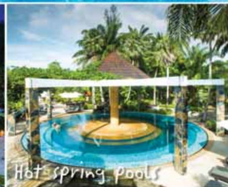
Hot spring pools