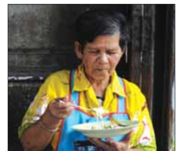
The Smart Food campaign aims to provide older people with better nutrition.

“Also, by starting now, we are helping businesses interested in this senior foods industry to have a better understanding of the products we need, and thus be able to compete on the market.”