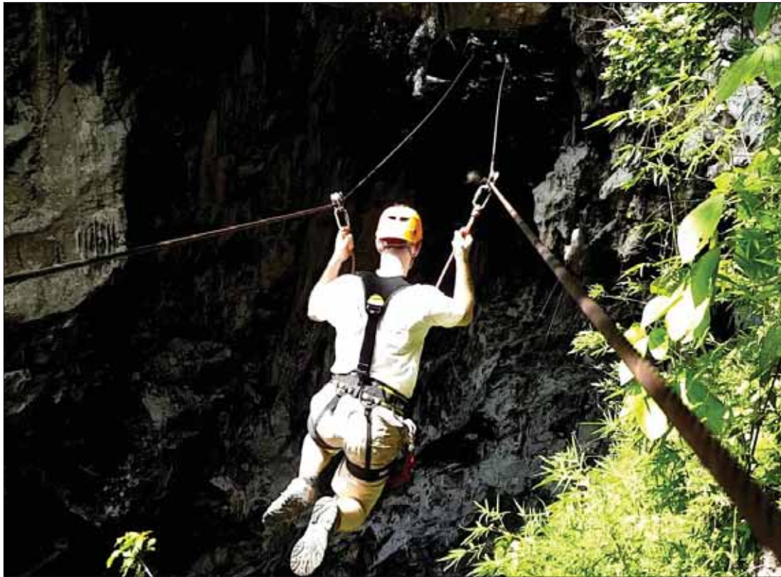
The author takes a plunge off of the 'Decapitation' zip line, before the Emperor's Swing.

"We had a top-rated ropes guy anchor that cable, and he left it half-tightened one day after work" Simon told me during our trek, "So the next day, when we're tightening the other cables, that one breaks free and