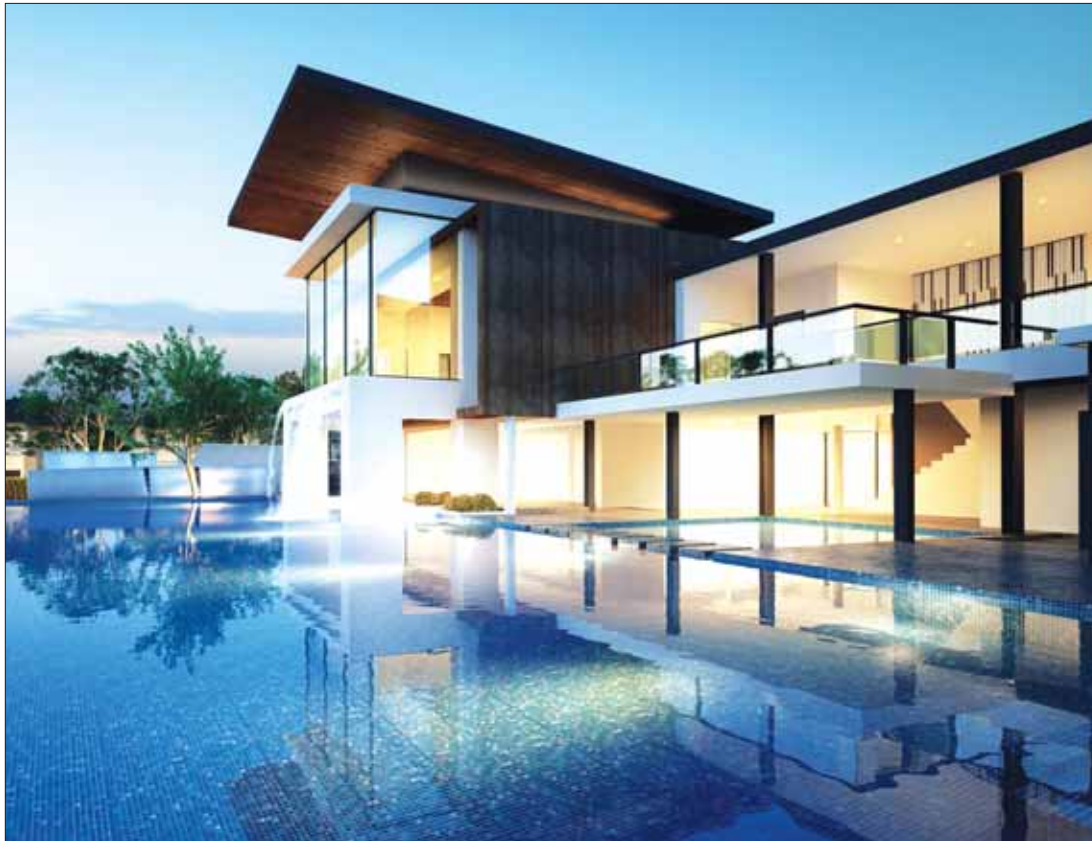
The Grando houses are additionally equipped with two balconies and a 25-meter-long swimming pool for its residents, with parking for at least two cars in each unit.

The houses range in size from 136 to 239 square meters, with 3-4 bedrooms and 3-4 bathrooms. Each house has a living room, although just the