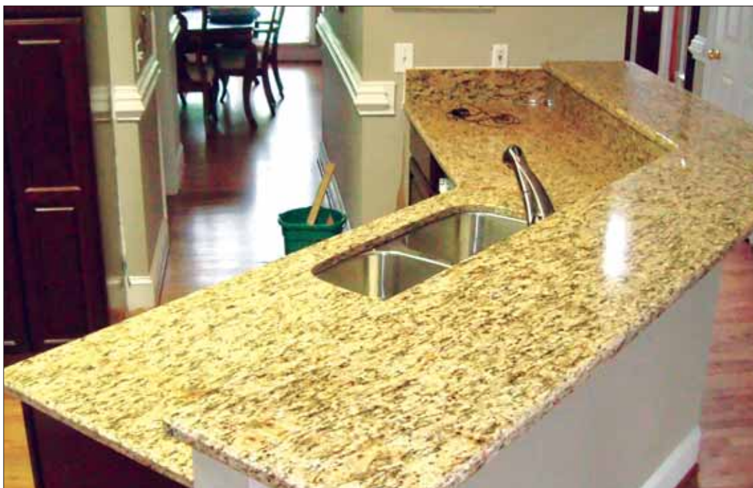
Granite counter tops should be properly sealed as soon as they are installed to protect against stains and scratches.

The wise thing to do is seal your granite as soon as it's installed. (Don't rely on your contractor or developer to do this). Out of hundreds of surveys I have performed, most have stains on the counter tops left over from construction personnel. Don't seal over a stain as it will be permanently locked in. If you have a stain there is a shop in Phuket called the Stone Doctor. They sell a fantastic product imported from Germany that should draw out the stain. They carry well over 40 products. And, of course, they