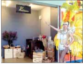
The Kathu Floating Market is the first of its kind to be launched in Phuket.

THE latest in Phuket's ever-increasing list of attractions is the Kathu Floating Market, located opposite the Loch Palm Golf Course.