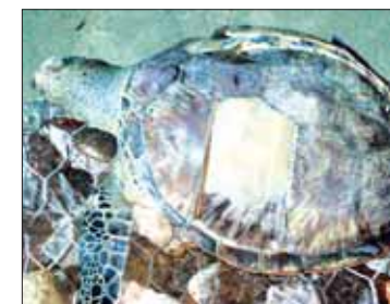
The turtle's shell was damaged.

"This is the second sea turtle death most likely caused by