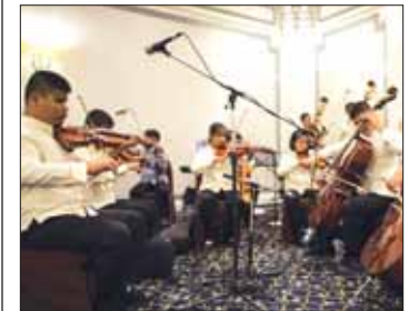
The orchestra performs at a charity dinner in Bangkok.

THE Thai Blind Orchestra performed at a charity dinner in Bangkok last week to entertain the audience with their music.