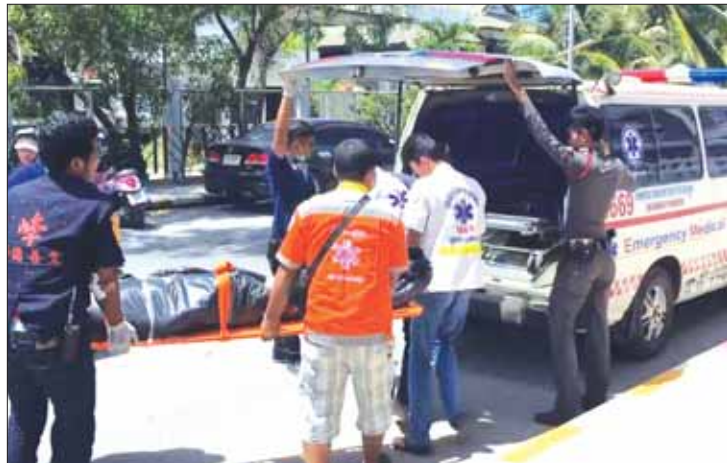
The victim was reportedly heard breathing heavily during the night, before he was found dead in his cell.

OFFICIALS are investigating the death of a man who was being held captive at the Bo Phut Police Station in Koh Samui on June 2.