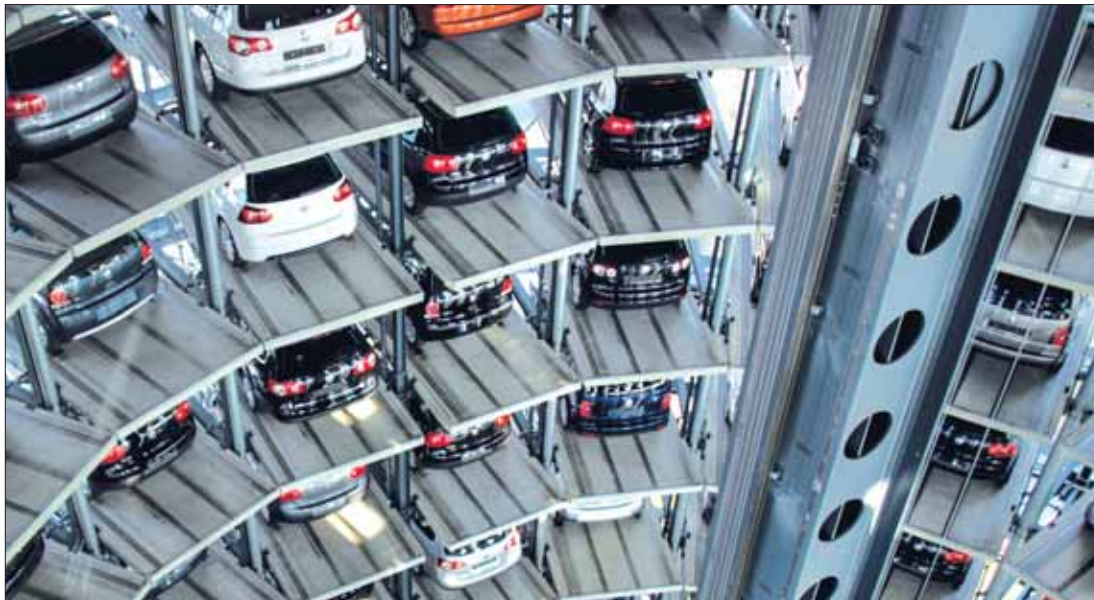
Automated car parking in Germany stores up to 400 vehicles at a time.

It's pretty common knowledge now how they seem to know what to advertise to you by collating inordinate amounts