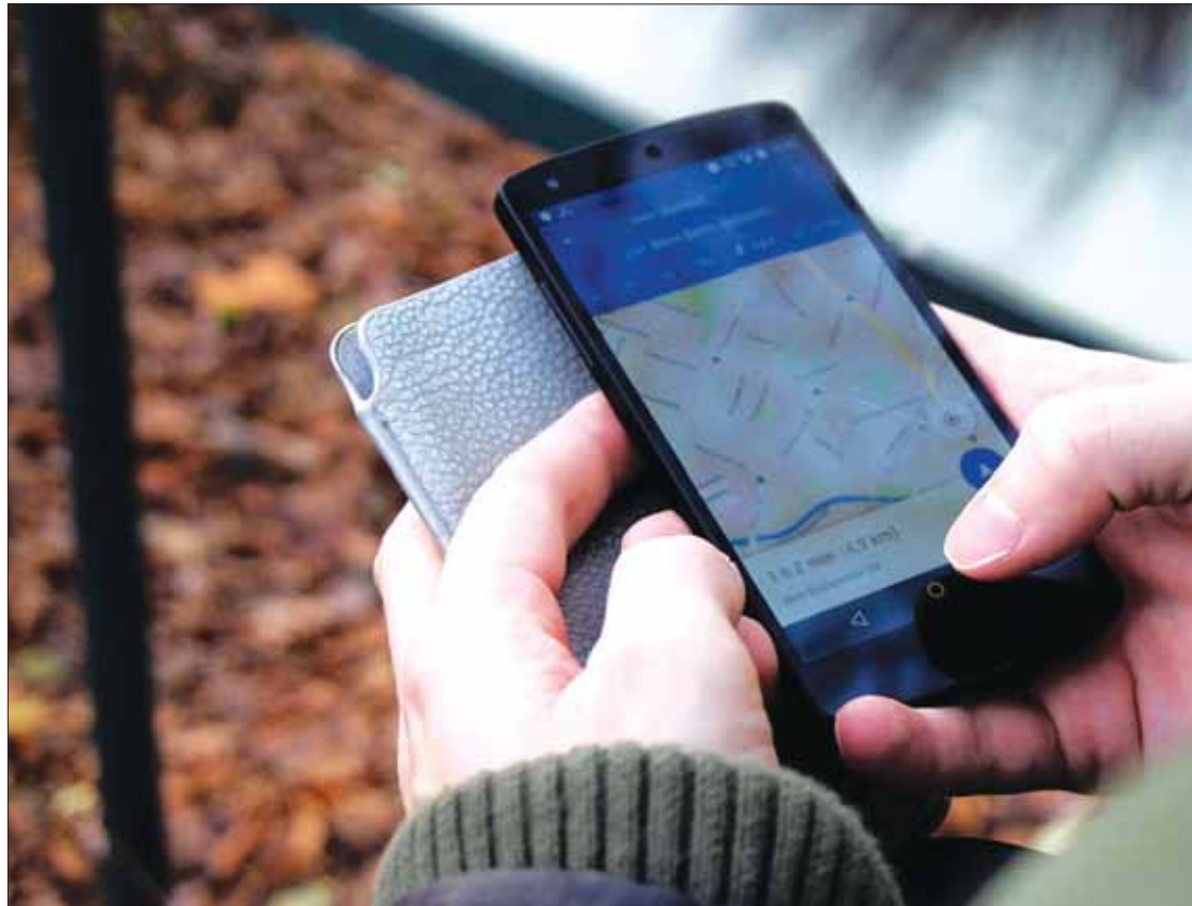
The mobile app will be backed by a DSI database, which will help potential buyers check land boundaries prior to purchases, thus saving them legal issues with the government in the future.

Many of the buyers were unaware of the illicit nature of their purchases, and have lost