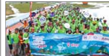
Cyclists at the slow ride event.

‘SLOW Life Ride in Hidden Cities’, part of the Nation Broadcasting Corp and the Tourism Authority of Thailand’s bid to get more cyclists touring the upcountry provinces, began last Sunday with 300 people riding around Phatthalung.