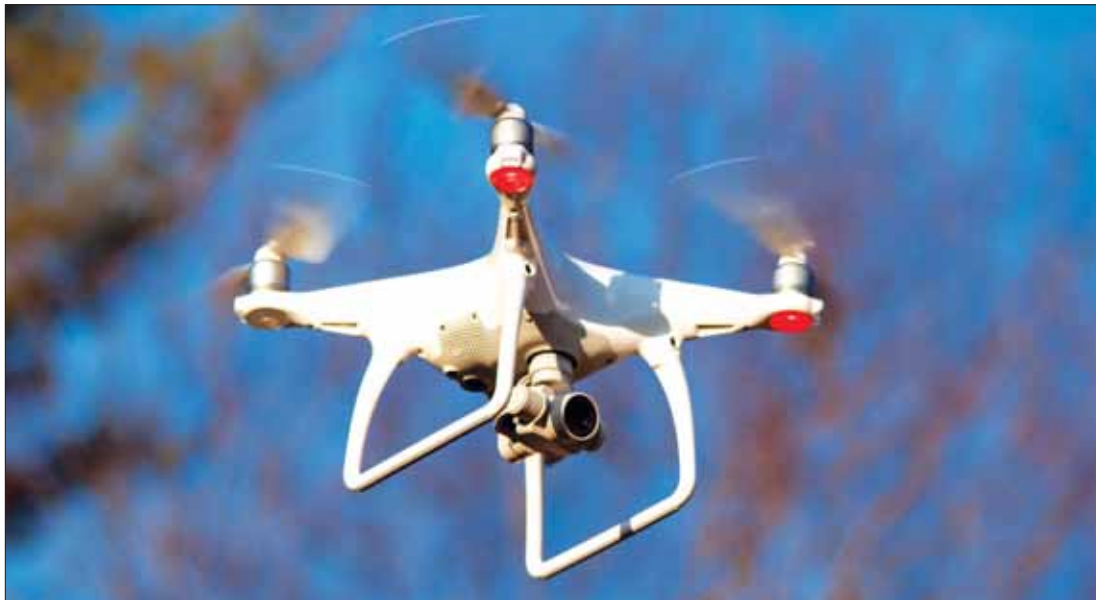
This is a new advanced drone with high definition 4k stabilized video and still camera, GPS stabilization, automatic obstacle avoidance, one of the many used by companies on the island.

Professional Real Estate photography now covers virtual 360-degree property tours, aerial photography, aerial video productions as well as interior/exterior photography. These are ideal for