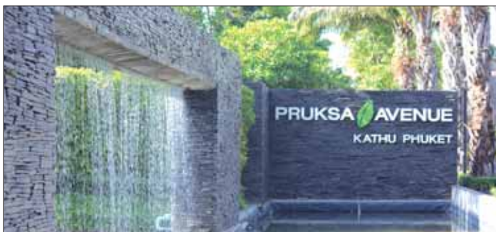
Pruksa Avenue right here in Kathu, Phuket.