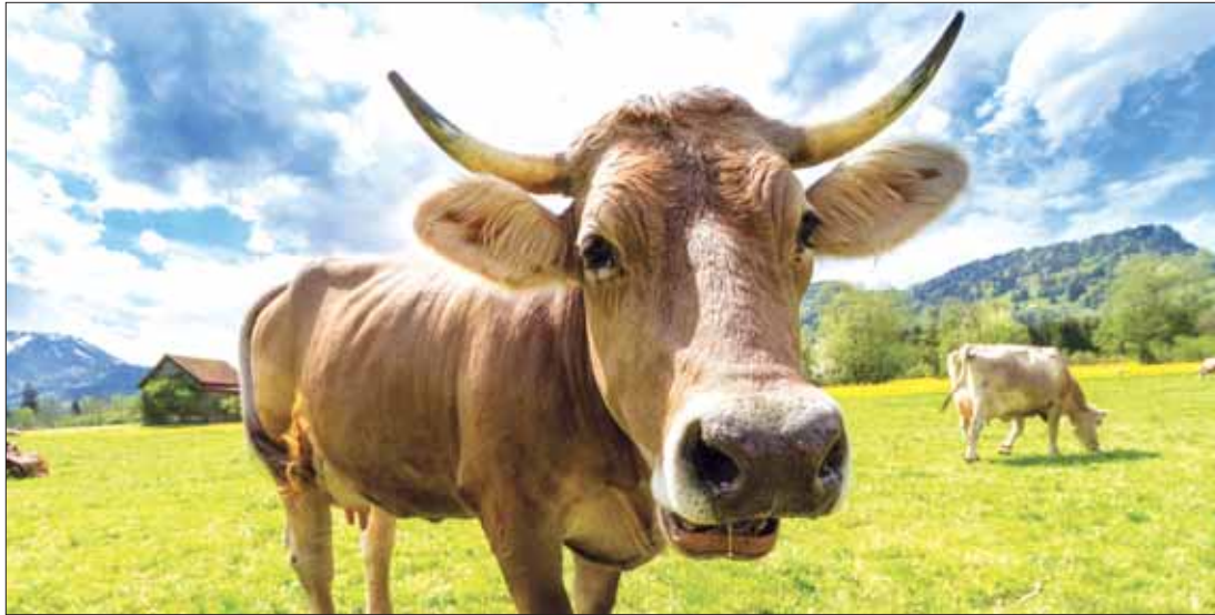
1.5 billion cows and other domestic livestock emit more methane than the world's entire transport system.

Talking of rotting, consider methane. Produced worldwide in much smaller quantities, it is nonetheless 25 times more ef-