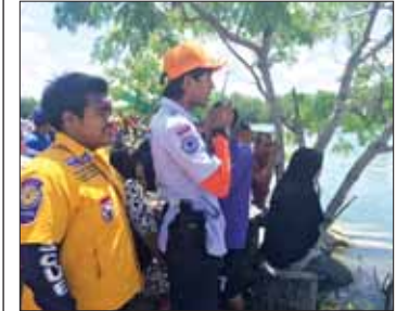
Rescue workers located the man's body in Phang Nga.

A PHUKET fisherman's body was found in Phang Nga on the morning of June 6, one day after he was reported missing from Mai Khao.