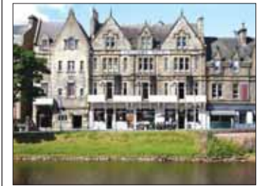
The Columba Hotel Inverness.

THAILAND-BASED Compass Hospitality Group is involved in the business for over 30 years, and on May 26, announced its entrance into the Scottish market with Columba Hotel Inverness, located on the banks of the River Ness and southern Scottish Highlands.