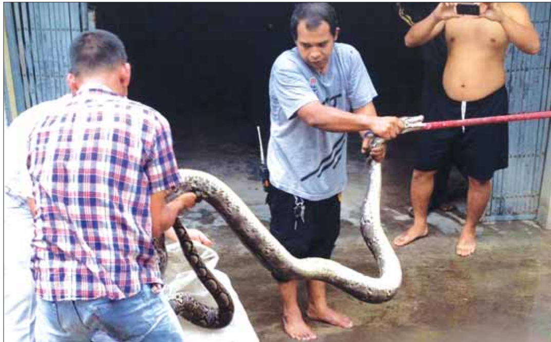
Rescue workers removed two four-meter long pythons found mating behind a house in Mai Khao on June 3. The male python weighed about 30kg and the female about 20kg. The reptiles were reportedly hiding in a cement drainpipe behind the house. It took workers two hours to pull them out. The two pythons were later released into the Khao Phra Thaeo Wildlife Sanctuary in Thalang.

Phuket's east coast, has long been a source of controversy, with reported sightings of armed gunmen, as well as the involvement of Phuket Governor Chamroen Tipayapongtada and Thai actor Puri Hiranpruk's family in the conflict over ownership.