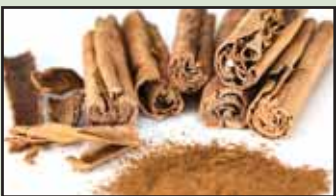
Cinamon is a natural growth stimulant.

An unlikely aid to germination and growth? Here's a simple explanation. Cuttings and seeds dipped in the solution for an hour or two will have absorbed a potential growth stimulant [the salicylic acid in aspirin], which also