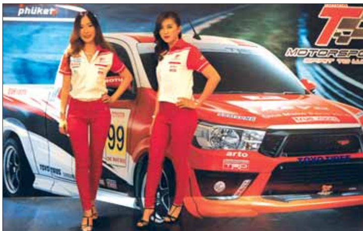
Phuket is the only province to host the event six years in a row.

“Phuket is the host city for the first round of this year’s series, to be held July 2-3,” said