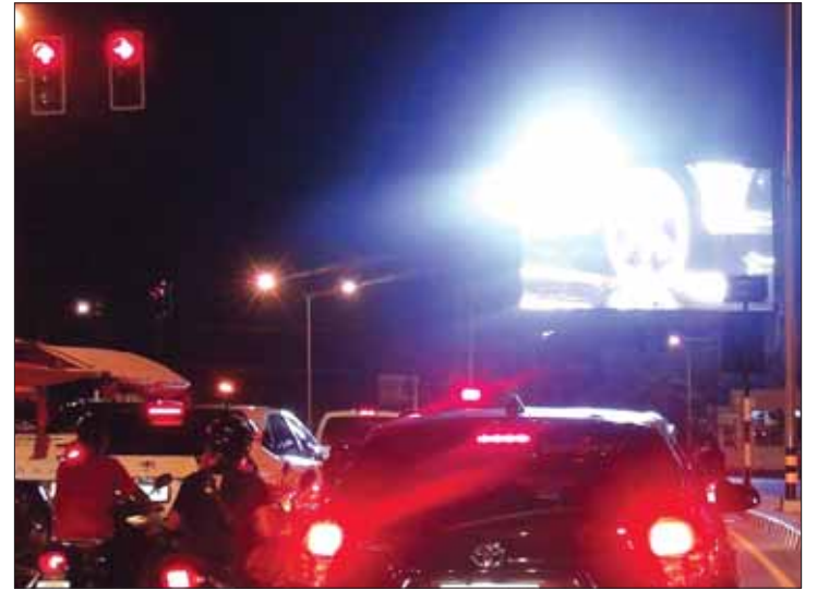
The billboard at a major intersection in Phuket City.

WICHIT municipality has asked the advertising company running an LED billboard at the Central Festival Intersection to dim their sign, after receiving complaints from commuters.