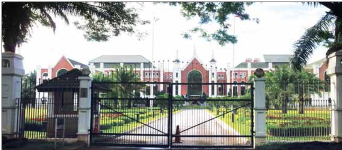
British International School Phuket.

Nord Anglia was founded in the UK and has headquarters in Hong Kong. The conglomerate has 42 international institutions