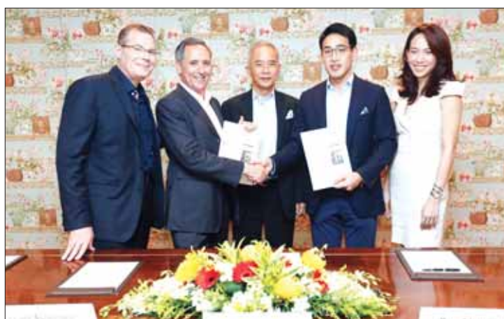
The new resort will be located at Kamala Beach as part of a luxury project.

"Phuket has always been an important destination in Southeast Asia for IHG, with the island's tourist arrivals recording double digit year-on-year growth since 2011," said Alan Watts, chief operating