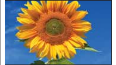
PM pushes farmers to grow alternatives to rice.

PRIME Minister Gen Prayut Chan-o-cha has advised farmers to grow crops that are suitable to current weather conditions.