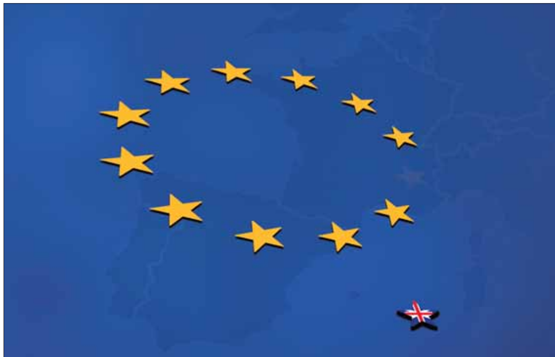
The UK will no longer need to follow any of the rules sanctioned by the EU.

The general trend worldwide since the financial crisis has been towards protectionist policies, which are almost always harmful to expats. While certain EU countries such as France and Holland have extremely high personal taxation rates for residents, once their citizens move abroad, their tax affairs become irrelevant to