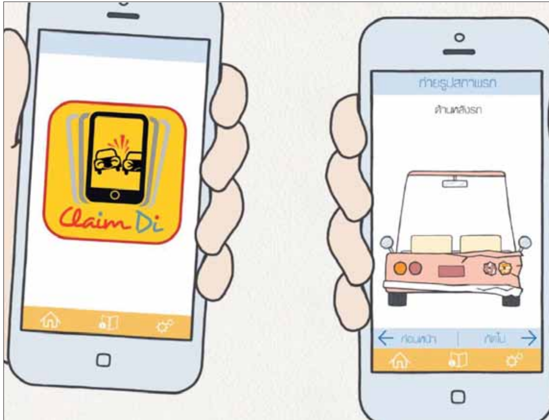
Claim Di facilitates communication and claims between drivers and their insurance companies, so they can complete their own transactions without waiting for a surveyor.

CLAIM DI is a new mobile application for facilitating communication and claims between drivers and their insurance companies, so they can complete their own transactions without waiting for a surveyor.