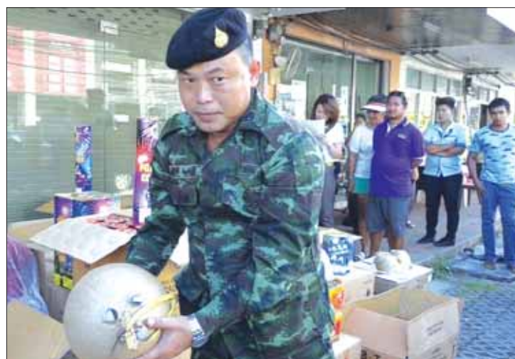
An officer holds a firework found in the townhouse.

After breaking in, police discovered hundreds of fireworks stored throughout the three-story building, including firecrackers, large cherry bombs and floating lanterns, which are banned on Samui due to the dangers posed to aircraft.