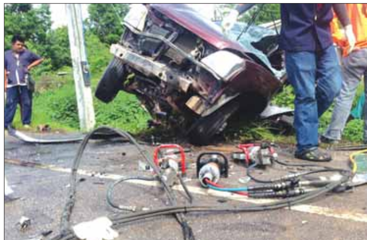
Above: The occupants of the truck succumbed to their injuries en route to the hospital. Below: Rescuers work to put out the fire after Ms. Prapatsorn’s accident.

TWO people were killed and two more seriously injured in a mid-morning car crash in Krabi on June 2.